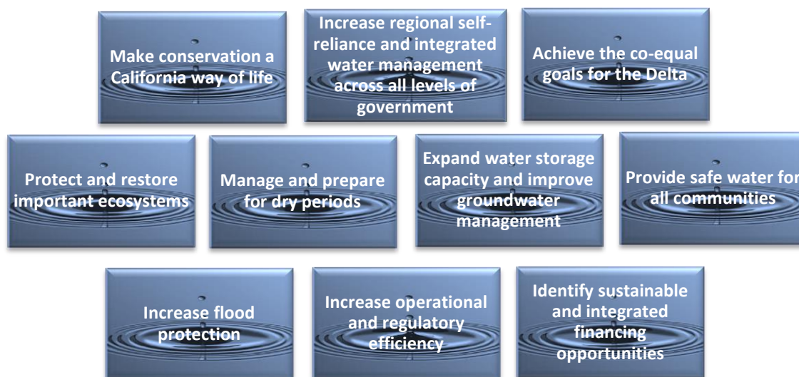
Figure 2. California Water Plan Action Items

This Storm Water Strategy further emphasizes and supports the following actions identified in the California Water Action Plan: