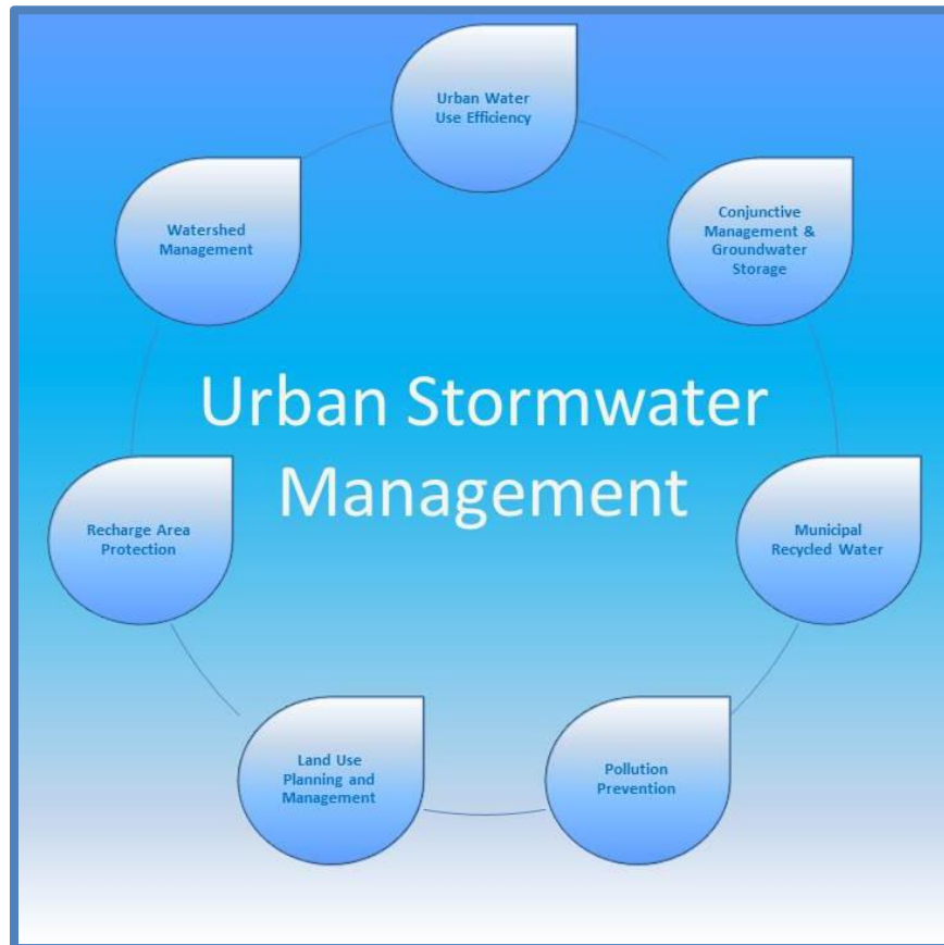
Figure 1. Urban Stormwater Runoff Management