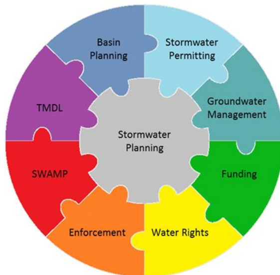
Figure 3. Storm Water Planning Interconnectivity with Water Board Programs

The Storm Water Planning Unit will collaborate with other related Water Board programs including but not limited to, storm water permitting, basin planning, TMDLs, Surface Water Ambient Monitoring Program (SWAMP), enforcement, water rights, funding, and groundwater management, to ensure that input, updates, and assistance are provided holistically from a Water Boards perspective ( Figure 3 ). In addition, the Water Boards have assigned four Executive Sponsors, along with committed participation from staff in four Regional Water Boards (San Diego, Los Angeles, Central Coast, and North Coast) to assist and provide regional expertise and guidance for project outcomes.