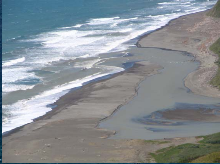
King Range ASBS, Humboldt County, (inset: storm runoff)