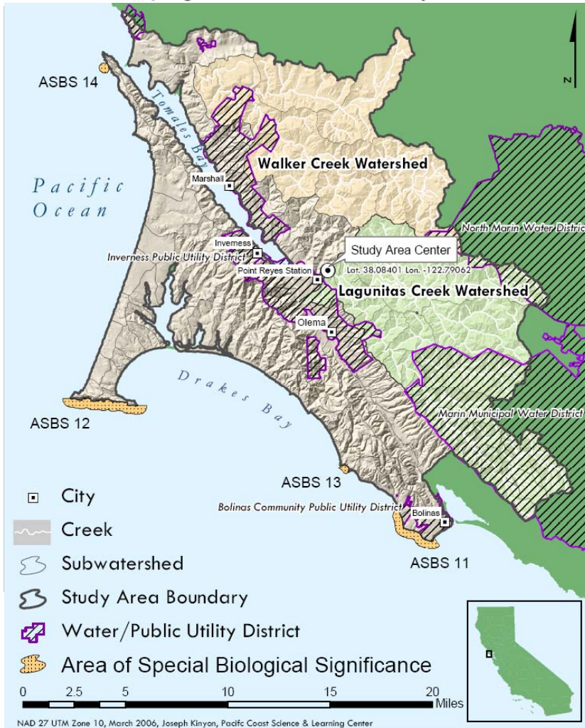
Tomales Bay Wetlands Restoration and Monitoring Program Water Sampling Locations in Tomales Bay Watershed