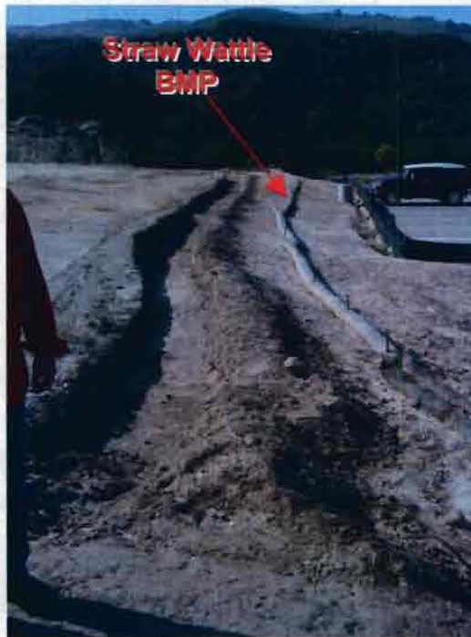
Photograph 11. 30/40 Ryan Ranch Court – Drainage ditch intended to direct storm water runoff flow off-site. (Note: Straw wattle BMP installed downgradient of drainage ditch)