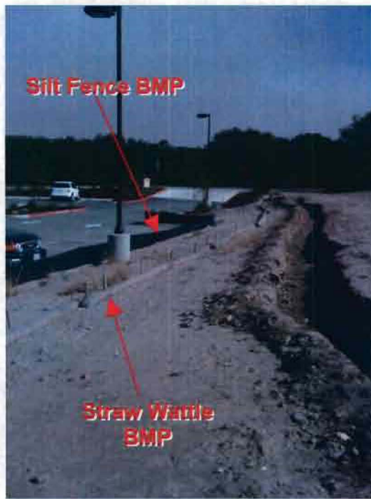
Photograph 13. 30/40 Ryan Ranch Court – Another view of drainage ditch. (Note: Straw wattle and silt fence BMPs installed downgradient of drainage ditch)