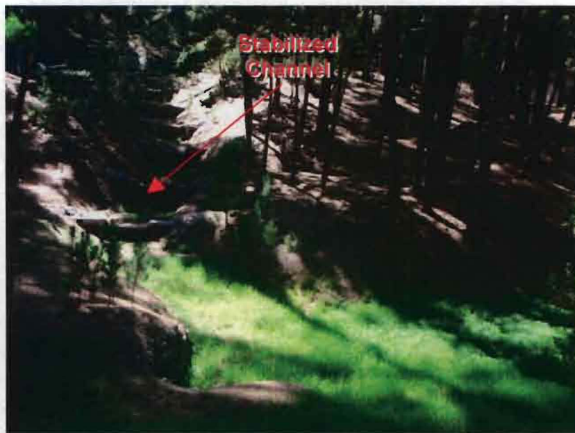
Photograph 42. Drainage channel restoration near upstream end of Windmere Creek.