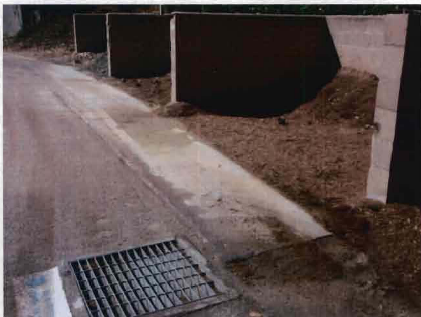
Photograph 30. Cemetery Corporate Yard – Another example of storage of unconsolidated materials adjacent to storm drain inlet without BMPs for inlet protection.