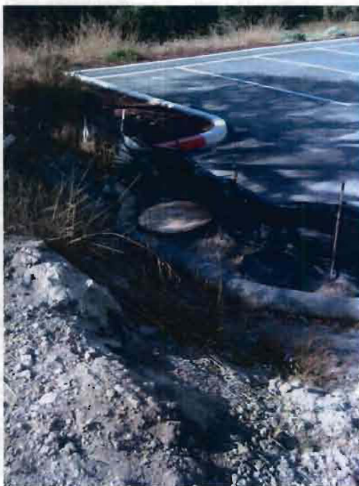
Photograph 15. 30/40 Ryan Ranch Court – Wattle and silt fence used to prevent runoff from entering parking lot. Exposed soil also present.