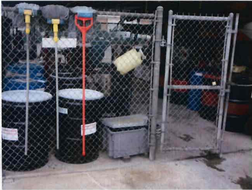
Photograph 27. Corporation Yard at Ryan Ranch – Close-up view of 55-gallon drums not within secondary containment, adjacent to drain to sanitary sewer.