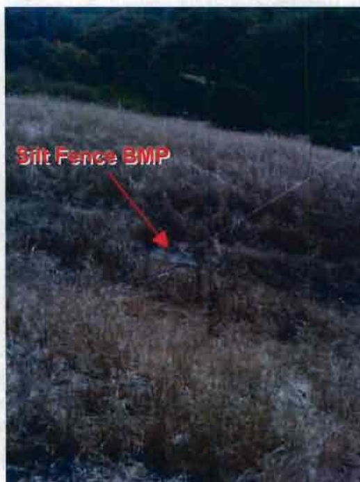
Photograph 10. 30/40 Ryan Ranch Court – Another example of collapsed silt fence BMP.