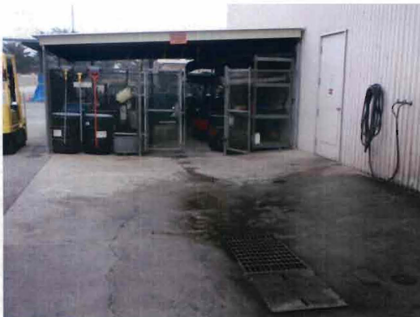
Photograph 26. Corporation Yard at Ryan Ranch – Covered materials storage adjacent to vehicle wash rack that drains to the sanitary sewer. (Note: Several 55-gallon drums are not within secondary containment)