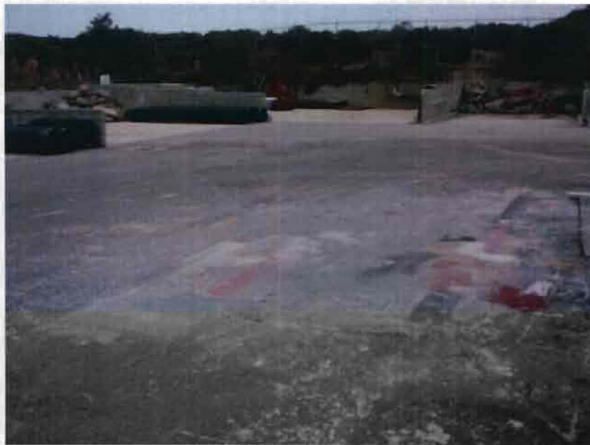
Photograph 22. Corporation Yard at Ryan Ranch – Debris and dried paint on ground surface in the paint truck refill area.