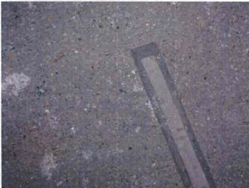
Photograph 23. Corporation Yard at Ryan Ranch – Close-up of debris on ground surface in the paint truck refill area.