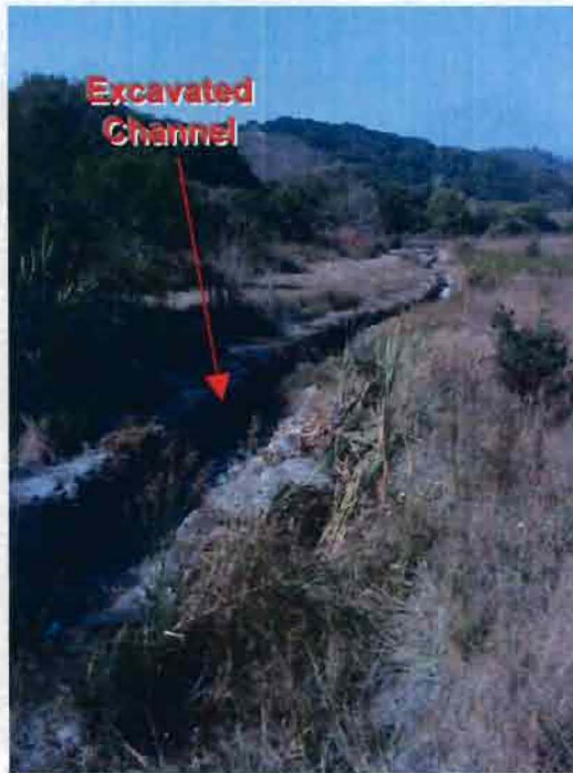
Photograph 39. Highway 68 Detention Pond – Another view of excavated channel to detention pond.