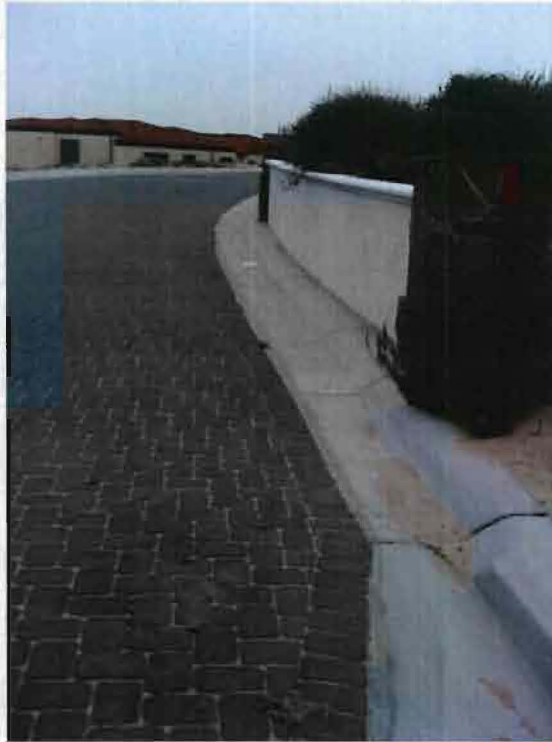
Photograph 1. 125 Spray Avenue – Sand accumulation in curb and gutter flowline.