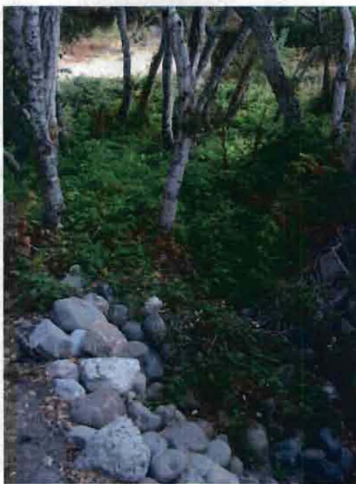
Photograph 17. 30/40 Ryan Ranch Court – Discharge into natural drainage area above detention basin.