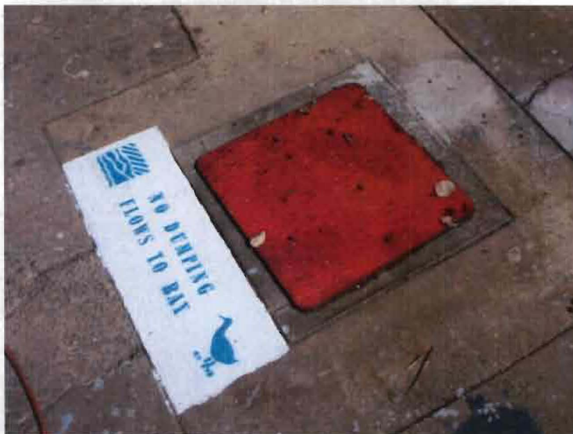
Photograph 33. Harbor Maintenance Corporate Yard – Example of cover placed on storm drain inlet when work is being performed outside in the area of the storm drain inlet.