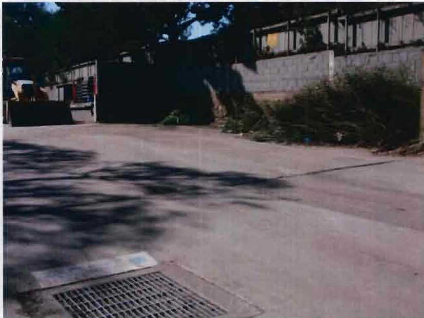
Photograph 28. Cemetery Corporate Yard – Example of storage of unconsolidated materials adjacent to storm drain inlet without BMPs for inlet protection.