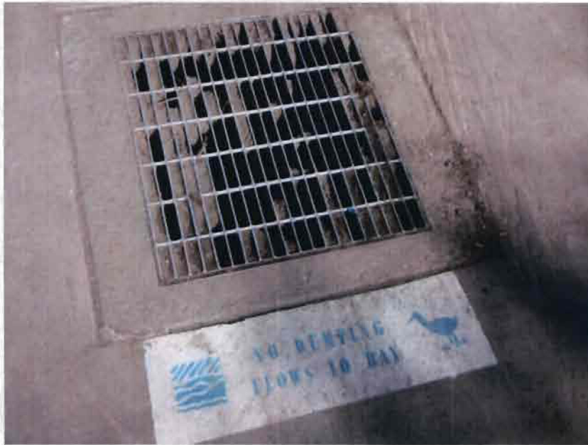
Photograph 31. Cemetery Corporate Yard – Example of unconsolidated materials within storm drain inlet.