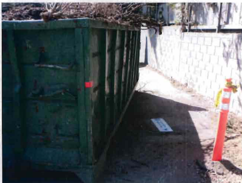
Photograph 29. Cemetery Corporate Yard – Example of storage of unconsolidated materials in trash bin adjacent to storm drain inlet without BMPs for inlet protection.