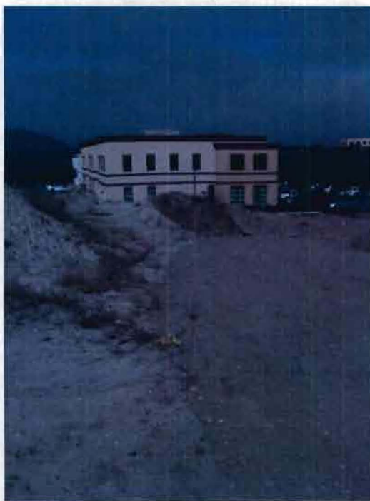
Photograph 5. 30/40 Ryan Ranch Court – Areas used as soil stockpile for excess fill material on yet-to-be developed parcel of land at the development.