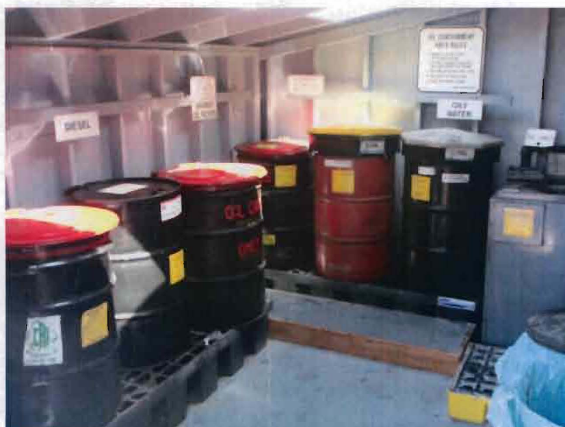
Photograph 34. Municipal Harbor and Marina – Example of disposal facility provided for patrons at the Municipal Harbor and Marina.