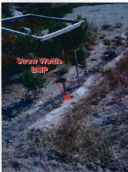
Photograph 7. 30/40 Ryan Ranch Court – Example of crushed straw wattle BMP.