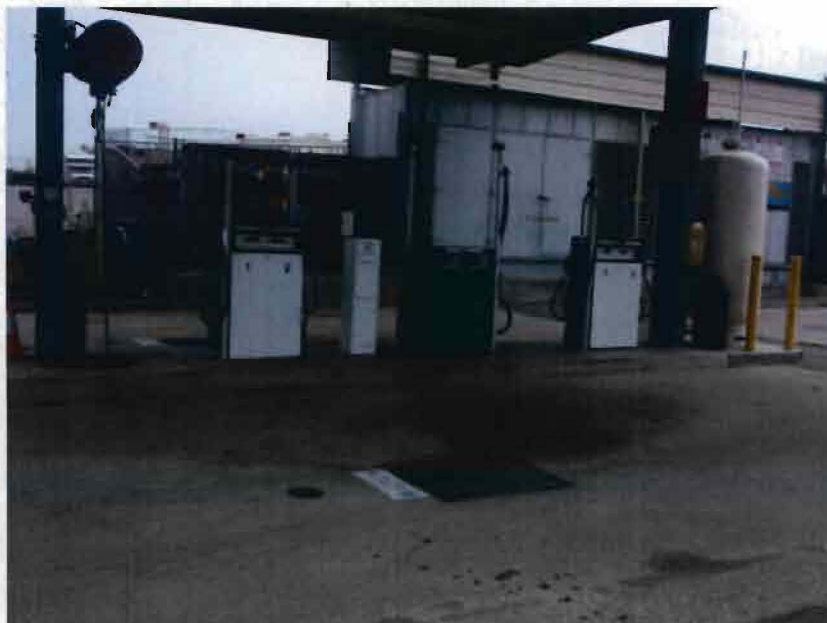
Photograph 24. Corporation Yard at Ryan Ranch – Vehicle fueling area at facility without spill response kit in immediate vicinity. (Note: Staining adjacent to storm drain inlet)