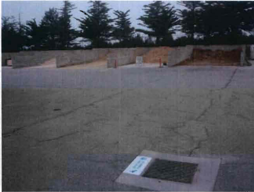
Photograph 21. Corporation Yard at Ryan Ranch – Another example of storage of unconsolidated materials adjacent to storm drain inlet without BMPs for inlet protection.