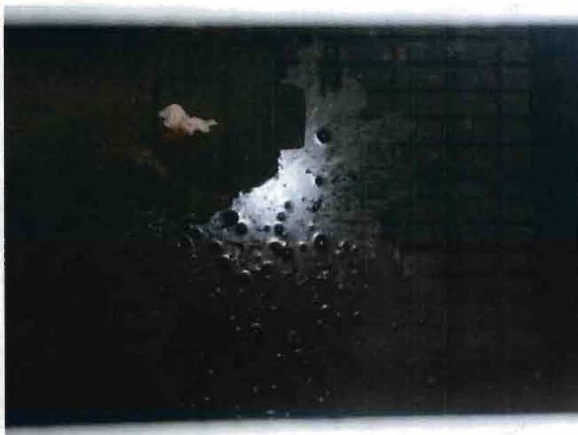
Photograph 25. Corporation Yard at Ryan Ranch – Close-up view into storm drain inlet pictured above. (Note: Oily sheen on water surface)