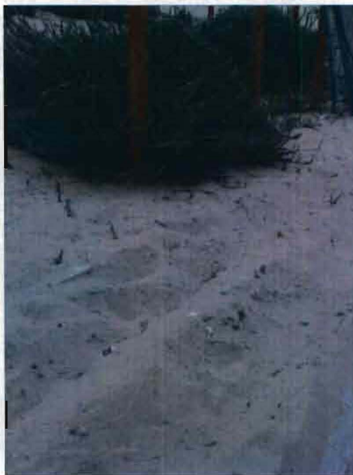
Photograph 4. 125 Spray Avenue – Another example of construction waste and debris on the ground surface at the site.