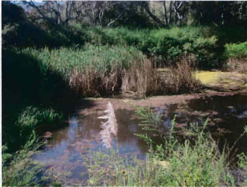
Photograph 35. Wilson Road Detention Pond.