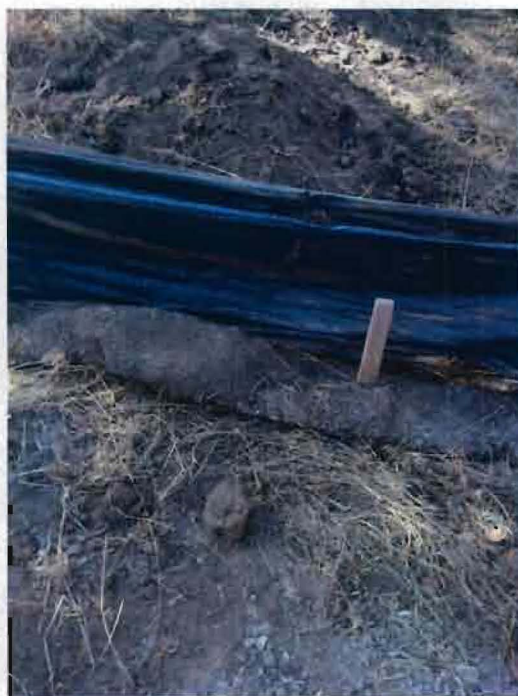
Photograph 6. 30/40 Ryan Ranch Court – Example of silt fence BMP not entrenched into the ground.