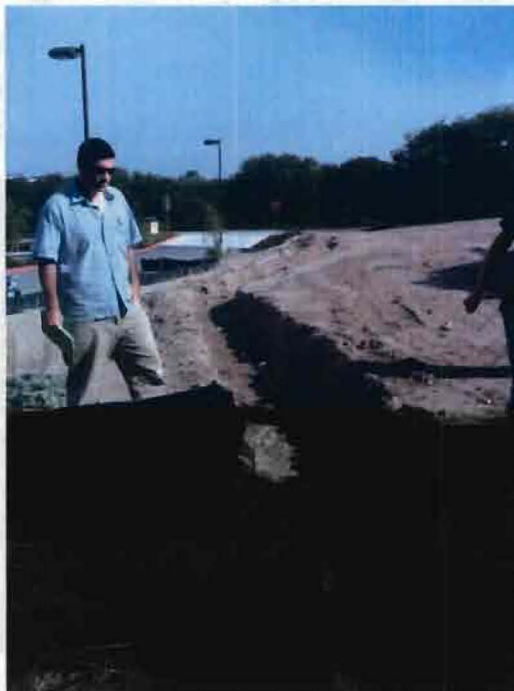
Photograph 12. 30/40 Ryan Ranch Court – Another view of drainage ditch.