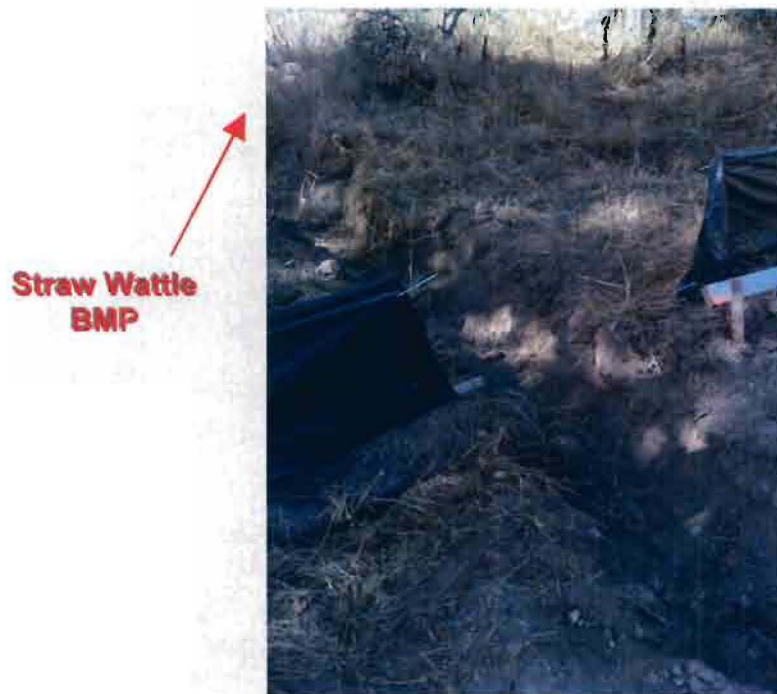
Photograph 14. 30/40 Ryan Ranch Court – A single straw wattle BMP had been installed to dissipate flow from drainage ditch. The wattle is not visible in this photo.