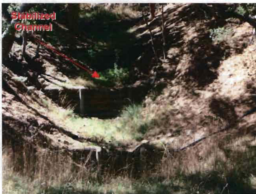
Photograph 41. Drainage channel restoration near Crandall Creek.