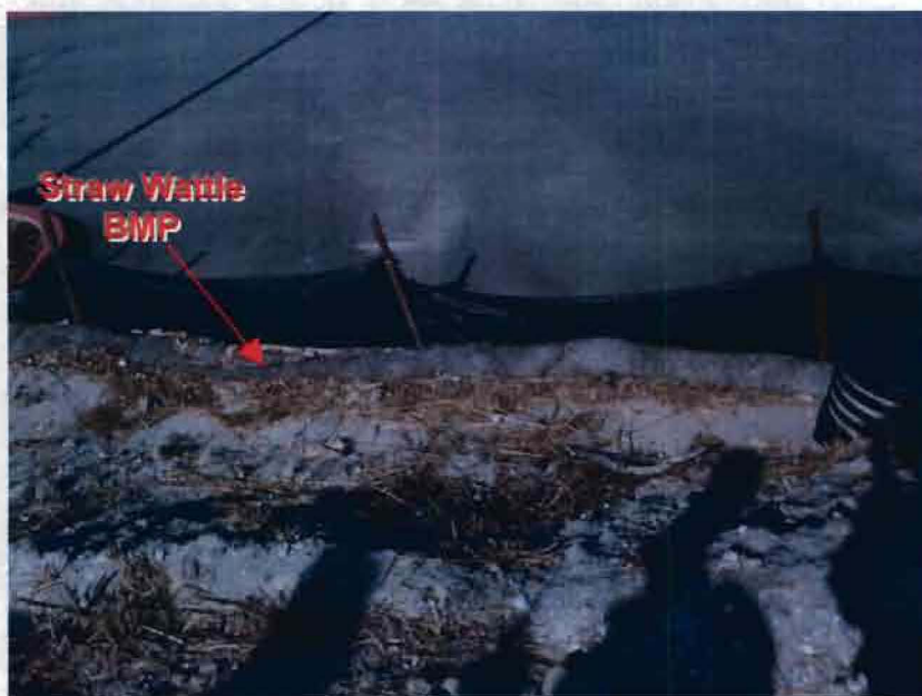
Photograph 8. 30/40 Ryan Ranch Court – Another example of crushed straw wattle BMP adjacent to silt fence.