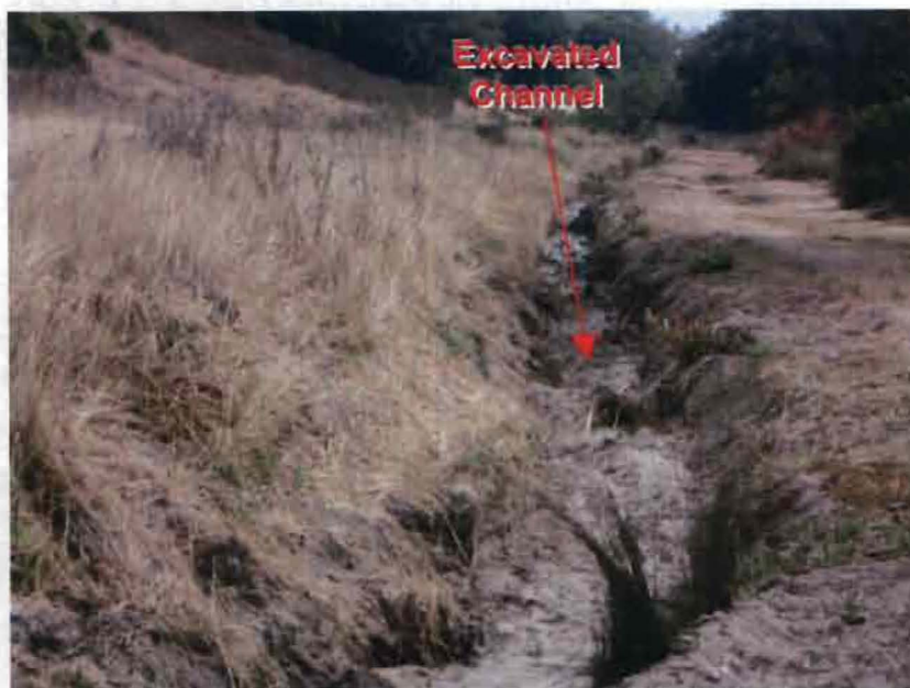
Photograph 38. Highway 68 Detention Pond – Excavated channel to detention pond.