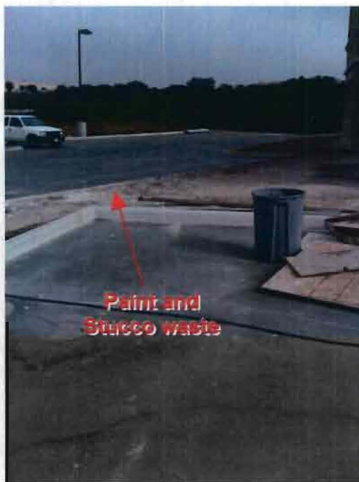
Photograph 18. 30/40 Ryan Ranch Court – Stucco and plaster waste on ground surface.