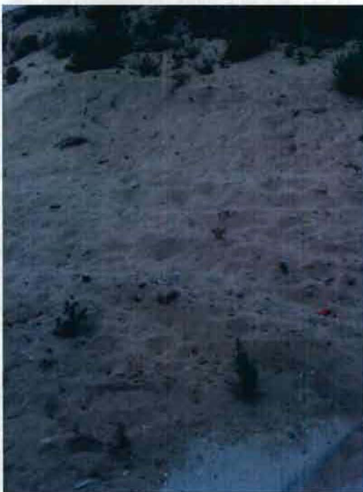
Photograph 3. 125 Spray Avenue – Example of construction waste and debris on the ground surface at the site.