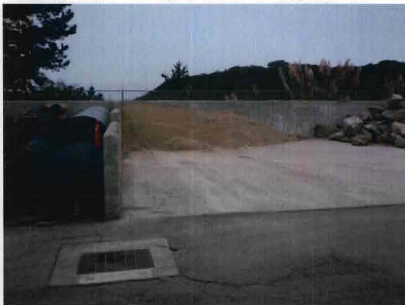
Photograph 20. Corporation Yard at Ryan Ranch – Example of storage of unconsolidated materials adjacent to storm drain inlet without BMPs for inlet protection.