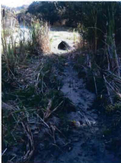
Photograph 40. Highway 68 Detention Pond – View upstream of dredged channel to detention pond.