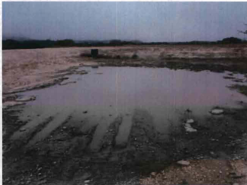
Photograph 36. Harris Street Detention Pond.