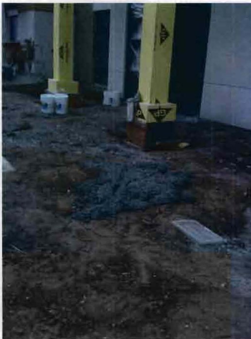
Photograph 19. 30/40 Ryan Ranch Court – Spilled concrete on ground surface.