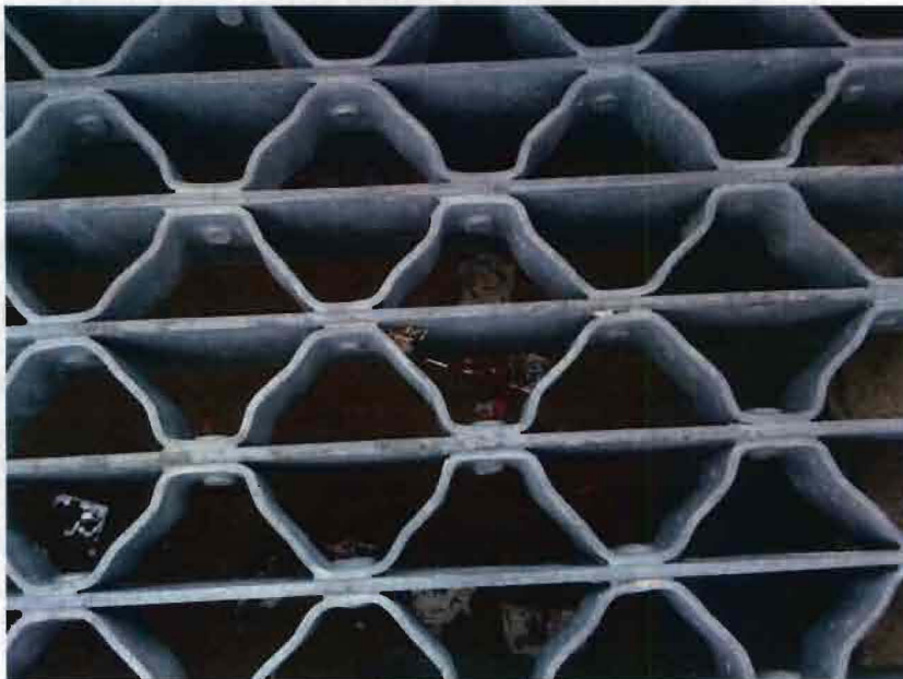
Photograph 2. 125 Spray Avenue – Sand accumulation within storm drain catch basin.