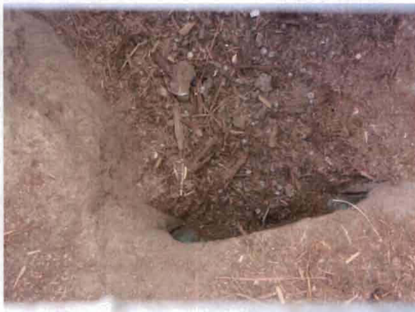
Photograph 32. Cemetery Corporate Yard – Close-up view into storm drain inlet pictured above in Photograph 30. (Note: Accumulation of mulch in storm drain inlet)