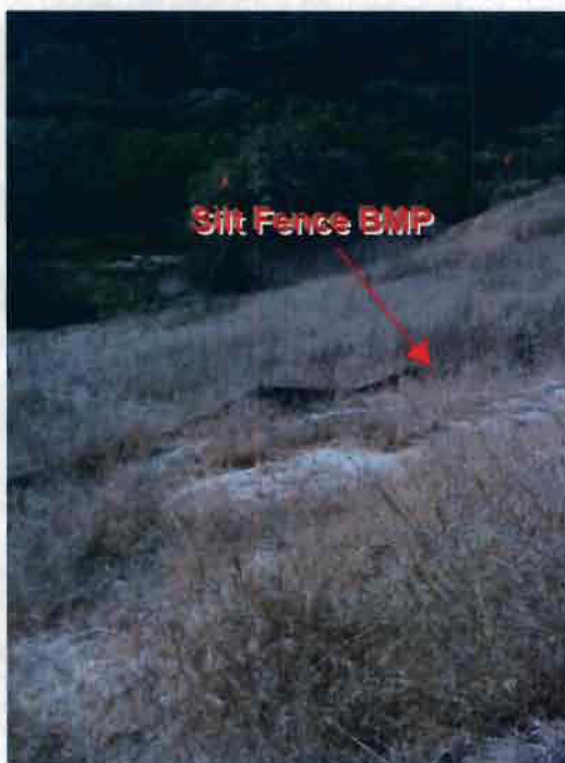
Photograph 9. 30/40 Ryan Ranch Court – Example of collapsed silt fence BMP.