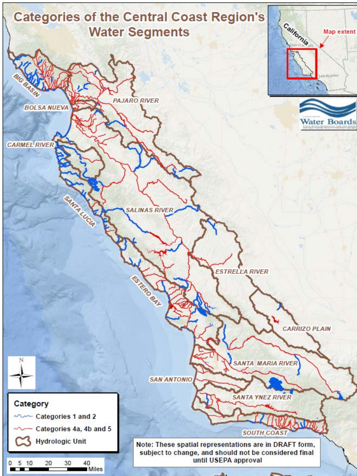
Figure 1. Map of all Central Coast Region's Hydrologic Units with water segments assessed for the 2014 Integrated Report. Water segments shown in blue are in 305(b) Report Categories 1, 2 or 3. Water segments shown in red are assigned to Categories 4a, 4b, or 5 and therefore are on the 303(d) List.