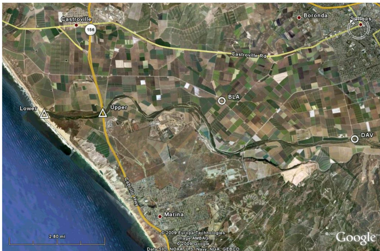
Figure 3. Map of the two Salinas River tributary stations (circles), Blanco Drain at Cooper Road (BLA) and the Salinas River at Davis Road (DAV).