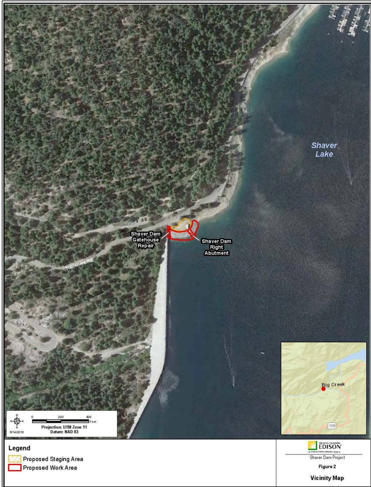
Figure 2- Work Area