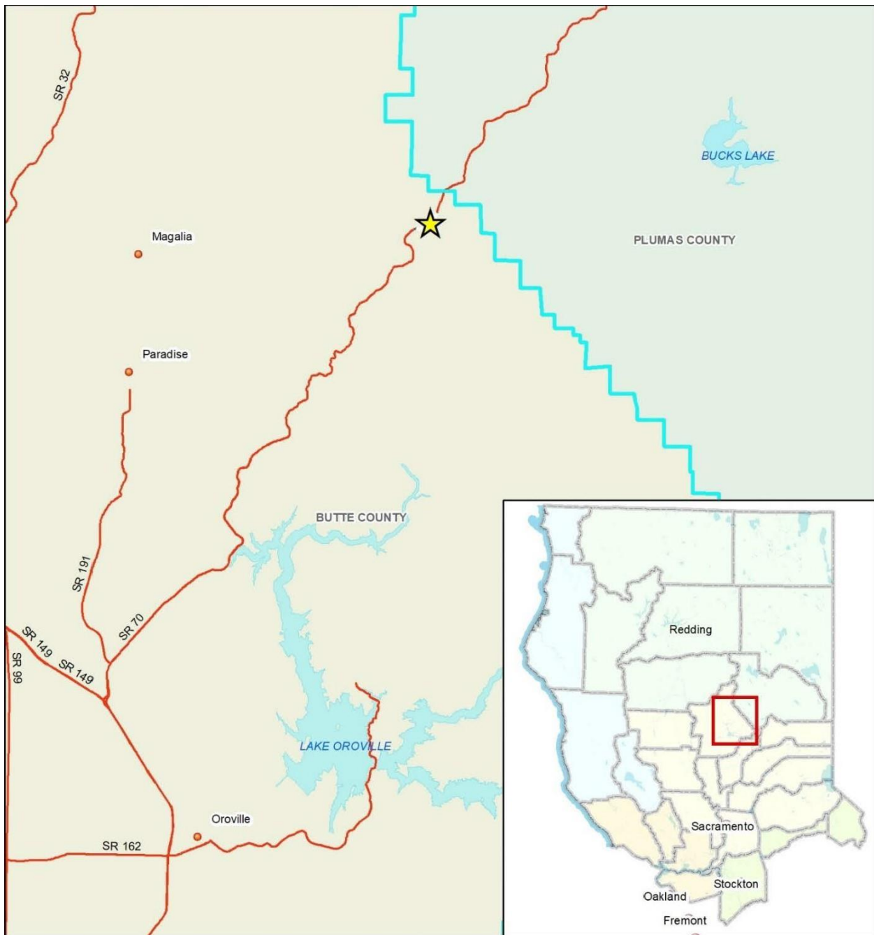
Figure 1. Project Location Map