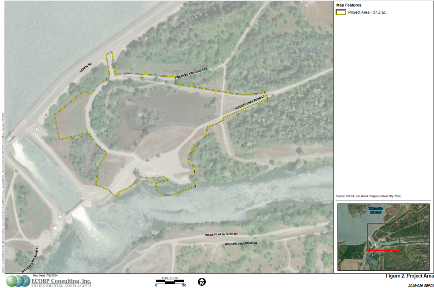
Figure 2: Project Area Map