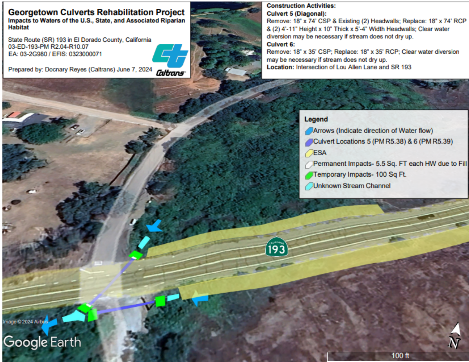
Figure 2: Location 5