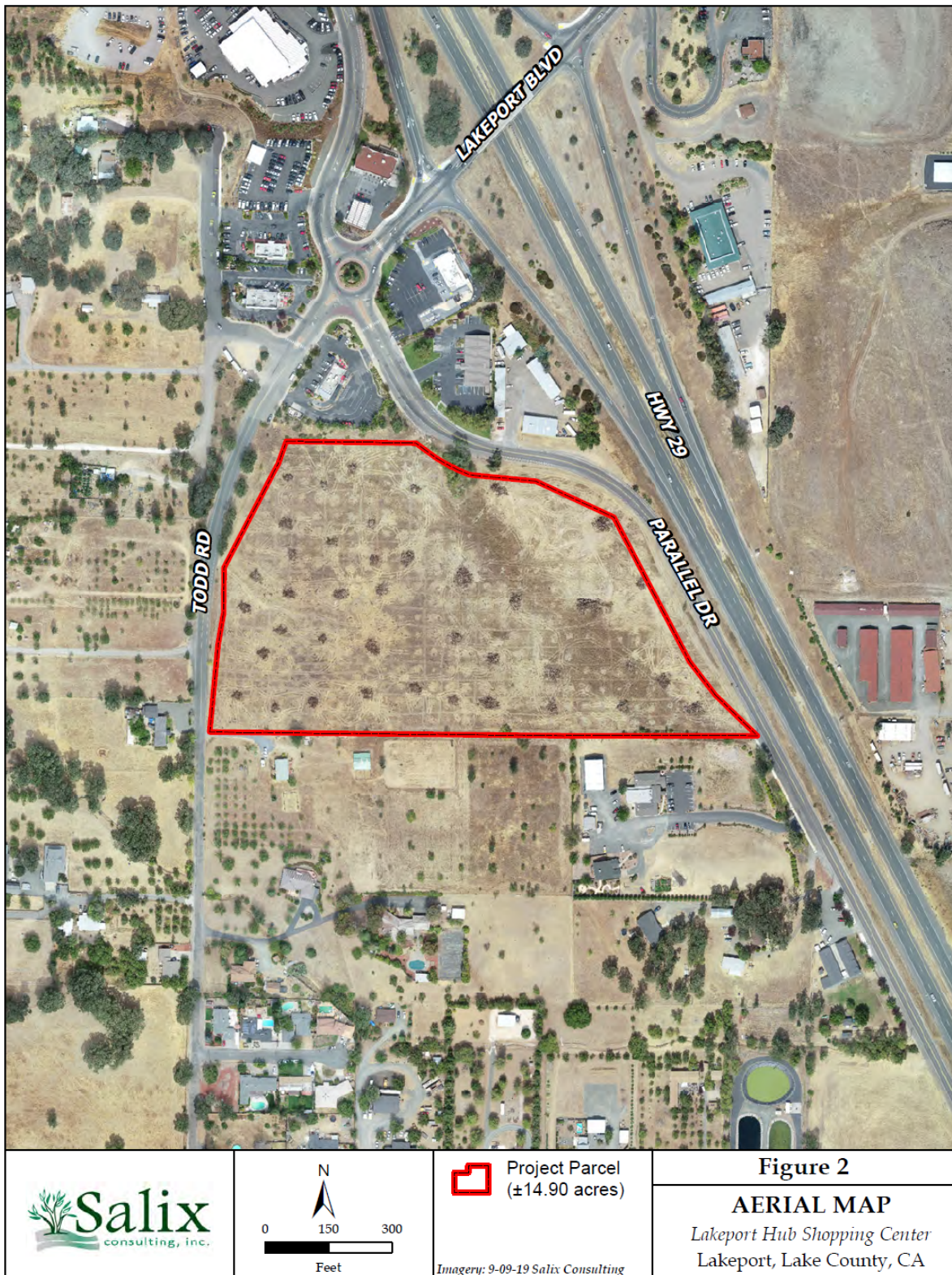
Figure 2: Site Map