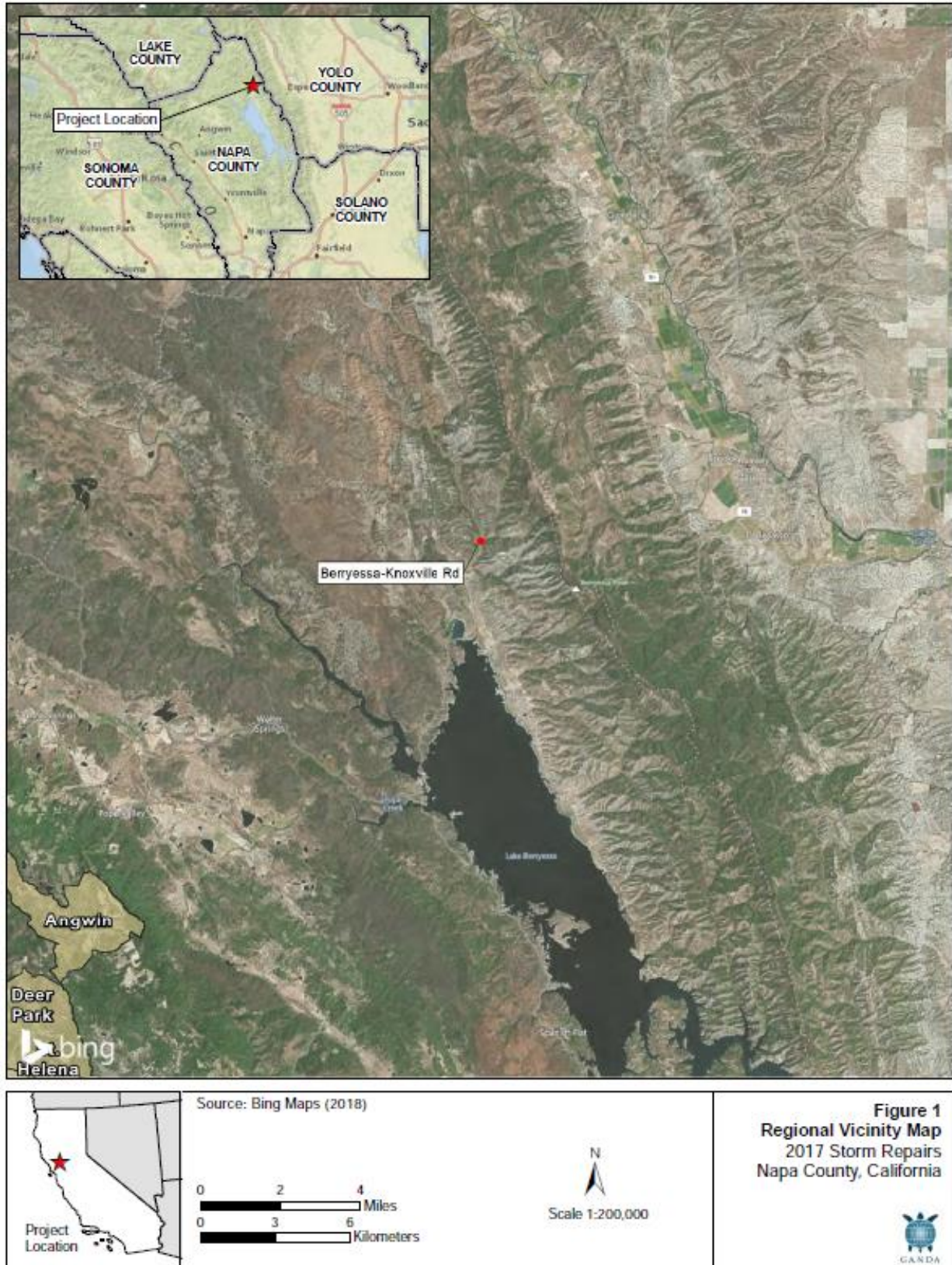
Figure 1 – Project Location Map