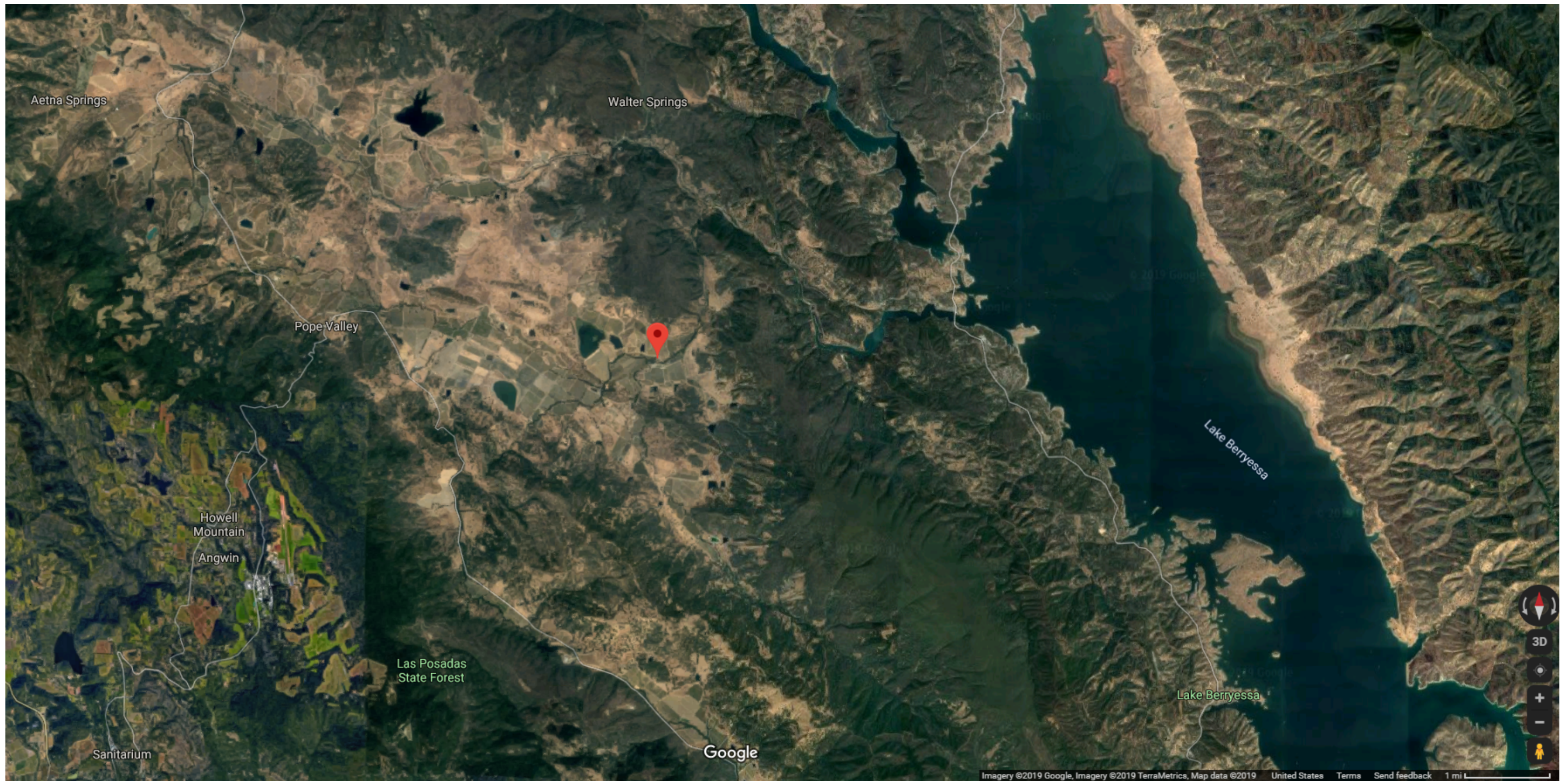
Figure 1 – Project Location Map