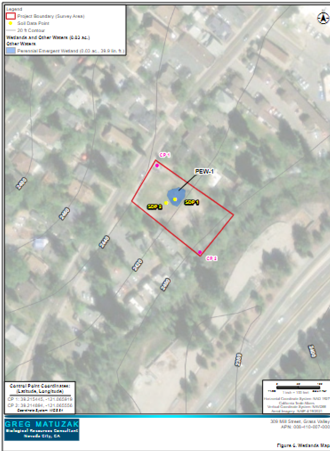
Figure 3: Wetlands Map