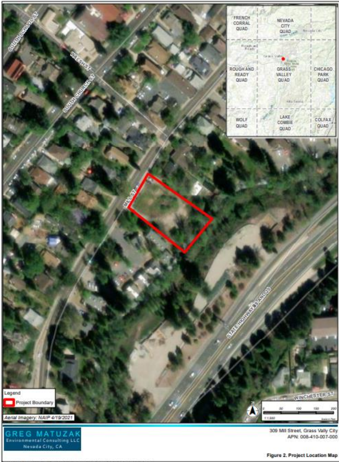
Figure 2: Site Map