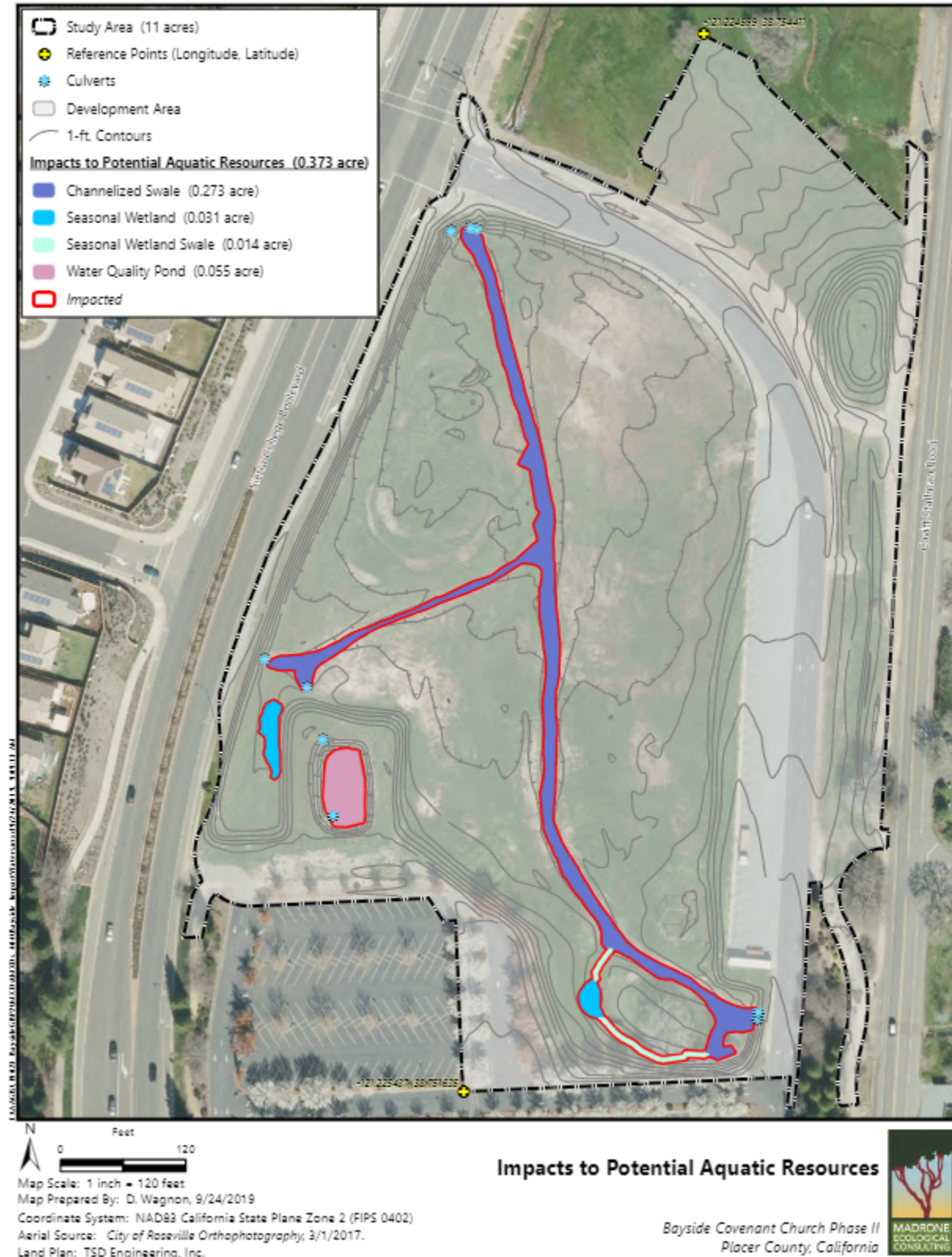
Figure 2 – Project Site Map