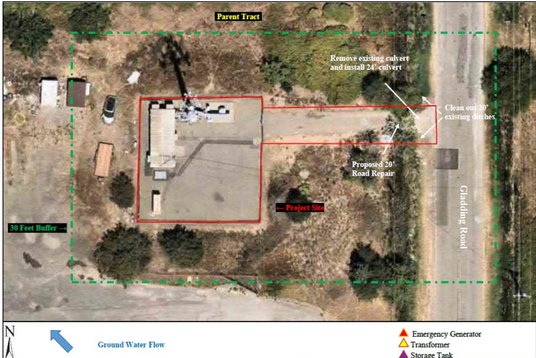
Figure 2: Project Site Plan