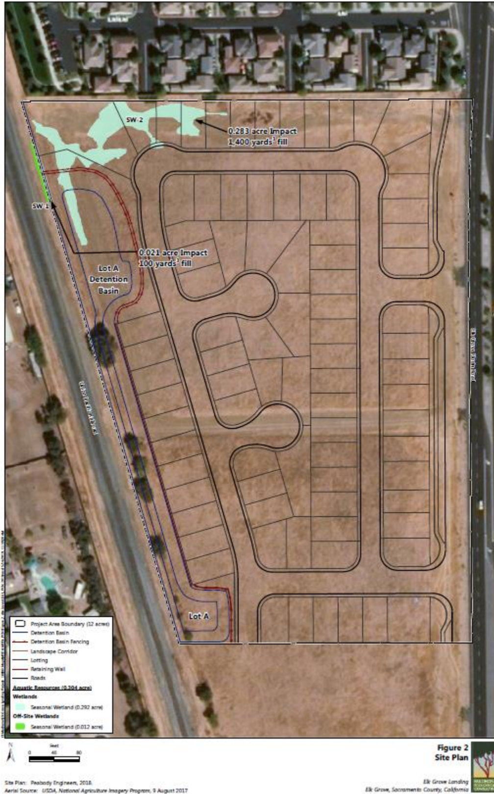
Figure 2 – Site Impact Map