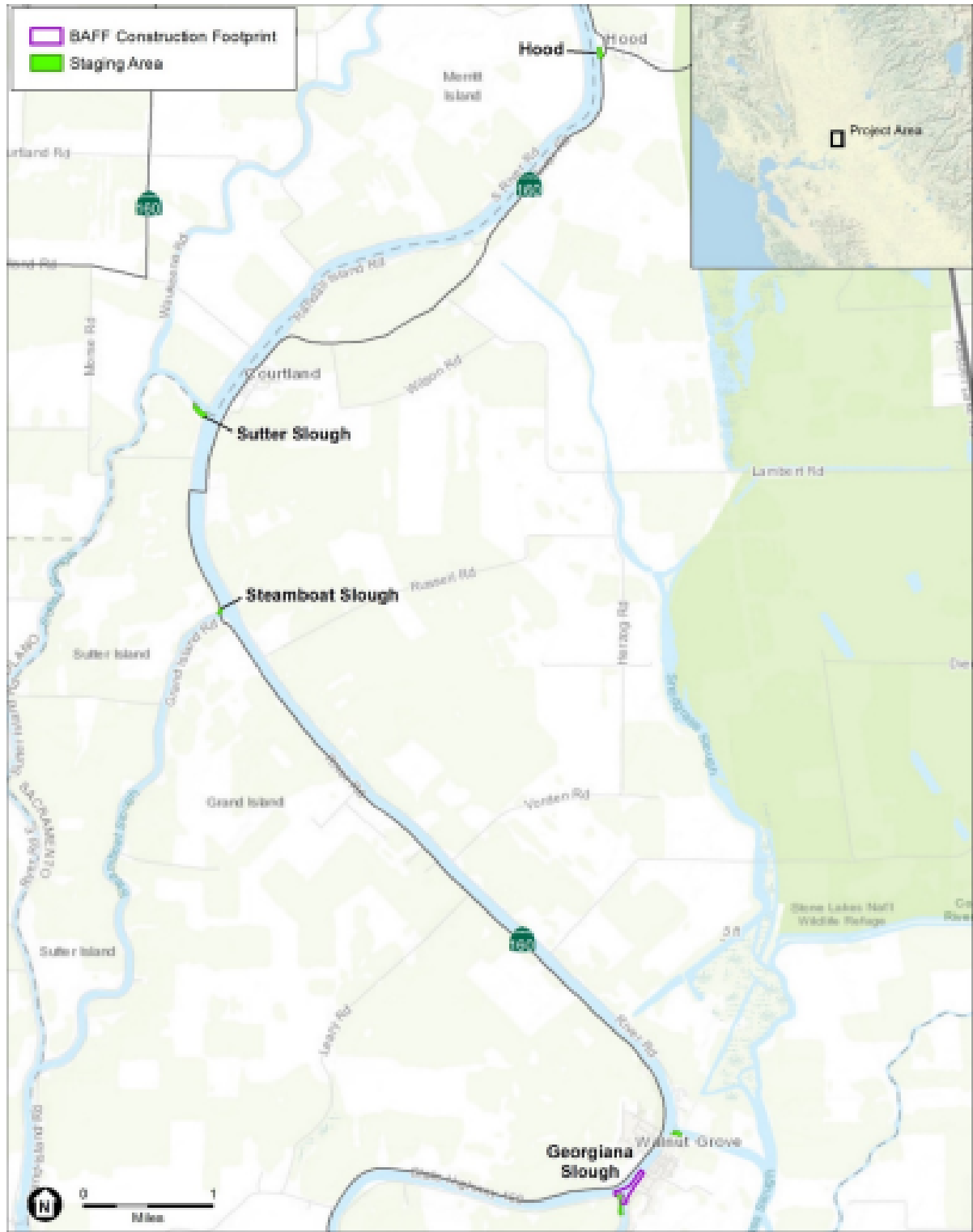
Figure 1: Site Location Map