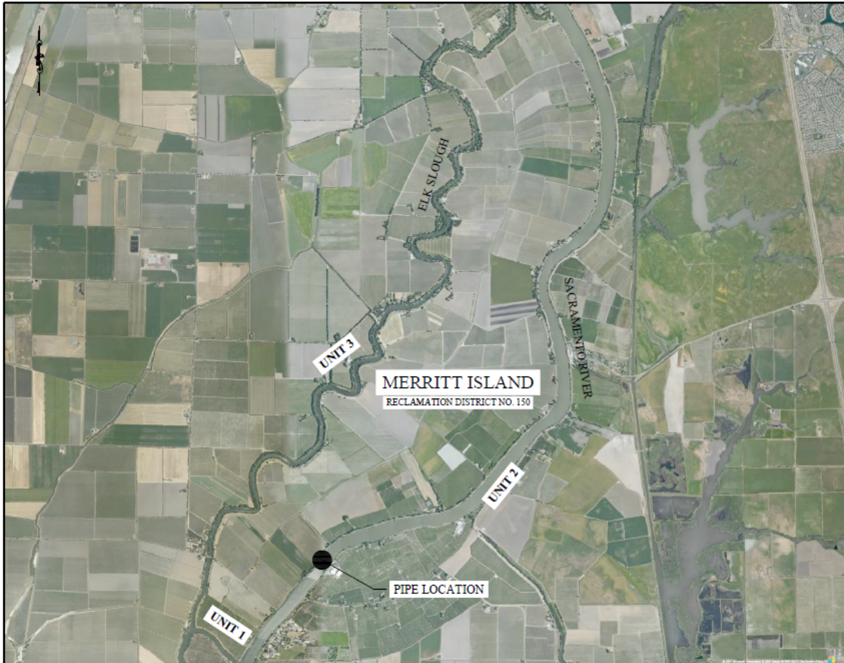
PROJECT AREA MAP