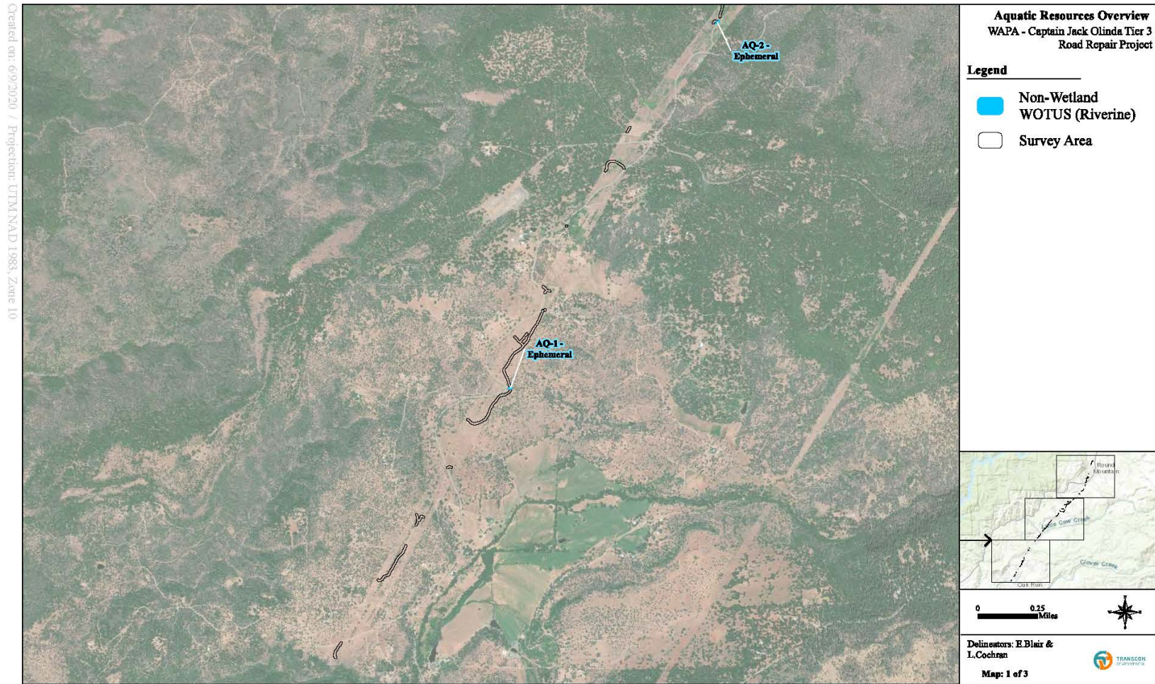
Figure 2. Impacts Map South Section