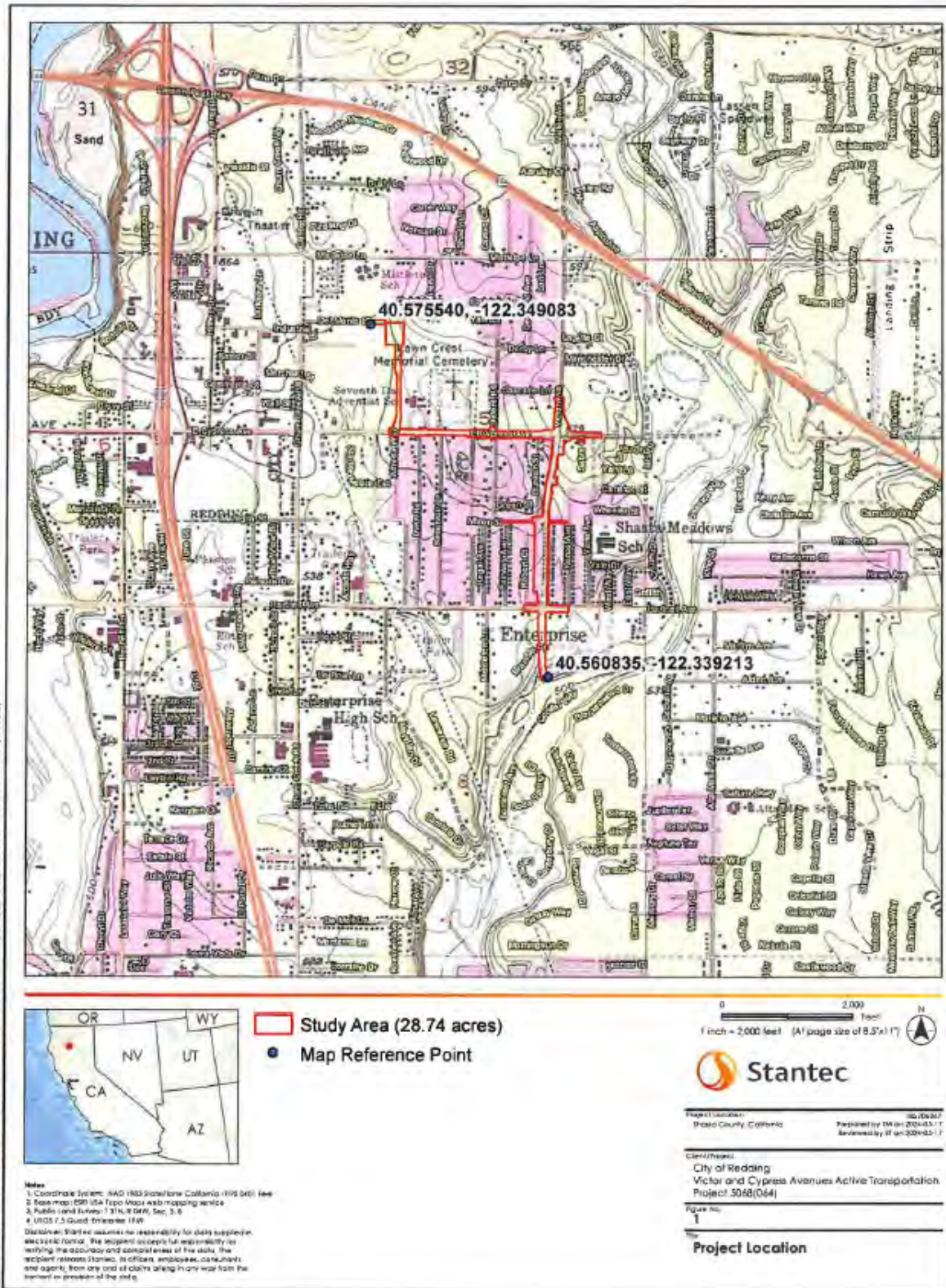
Figure 1: Project location map