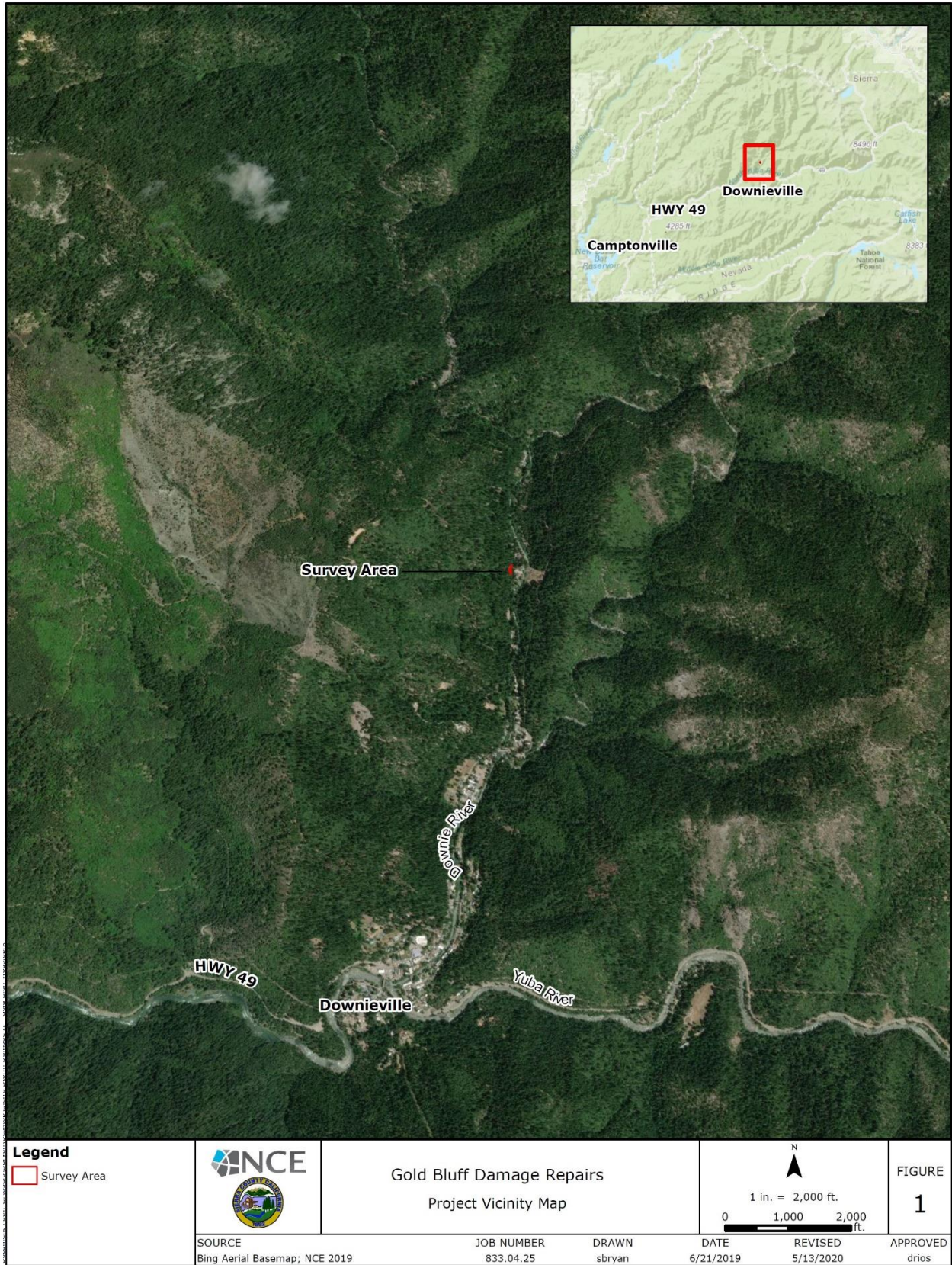
Figure 1 – Project Location Map