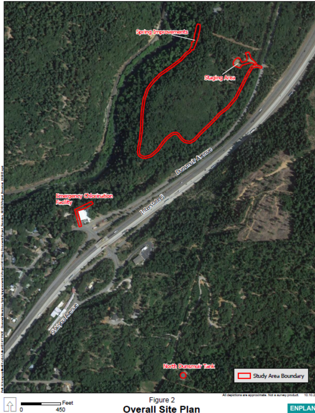
Figure 2 Overall Site Plan