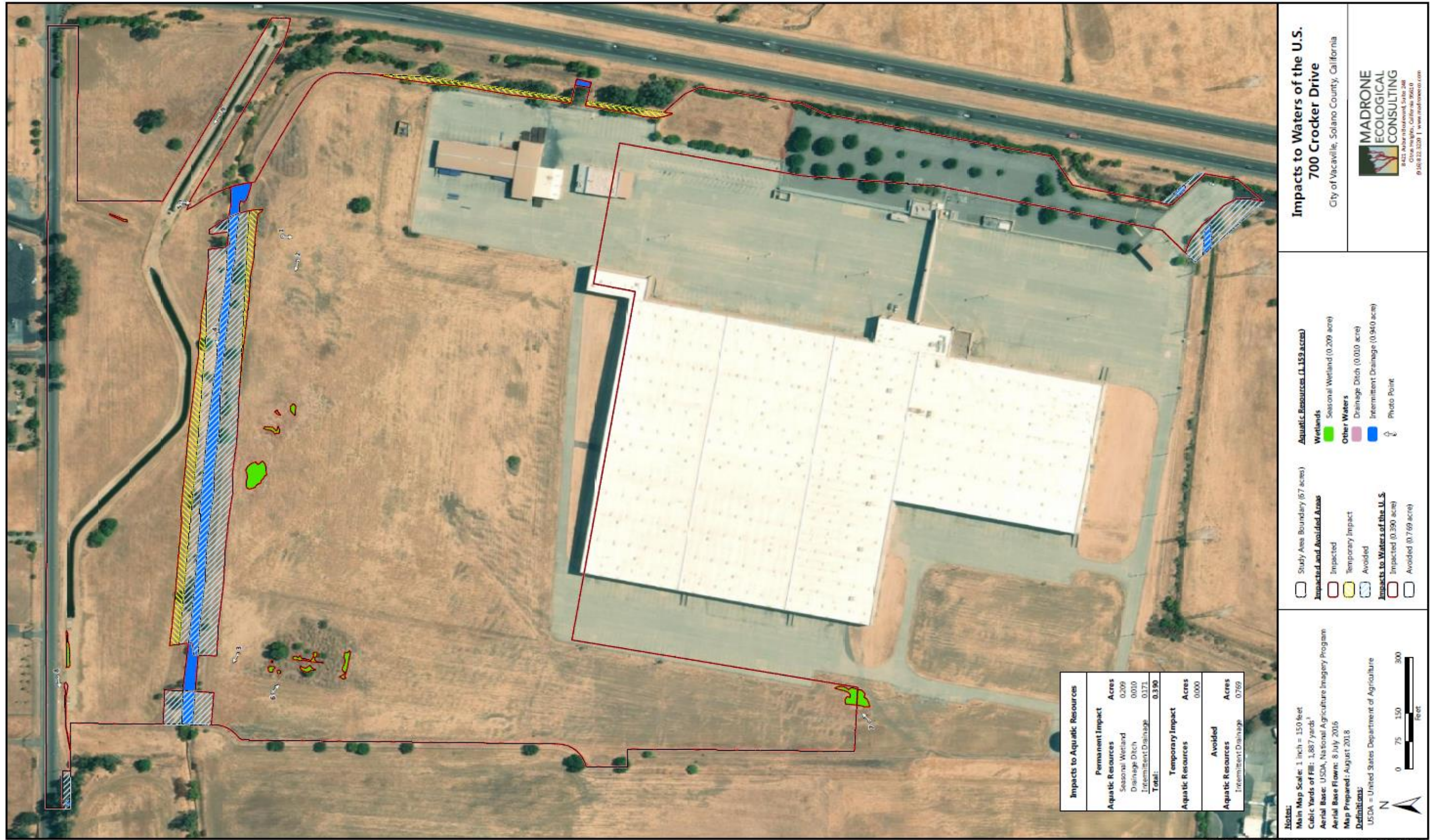
Figure 2 – Site Impact Map