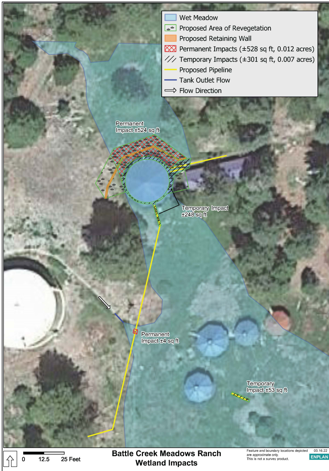
Figure 2. Impacts Map