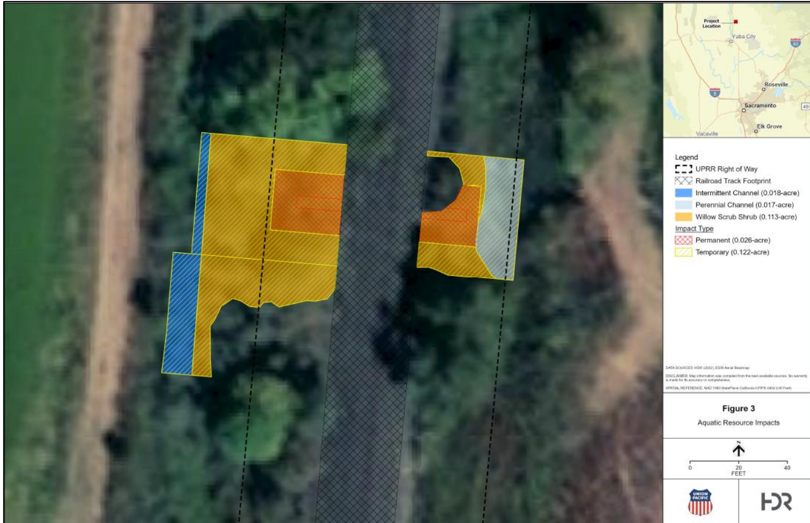
Figure 2: Project Impacts Map