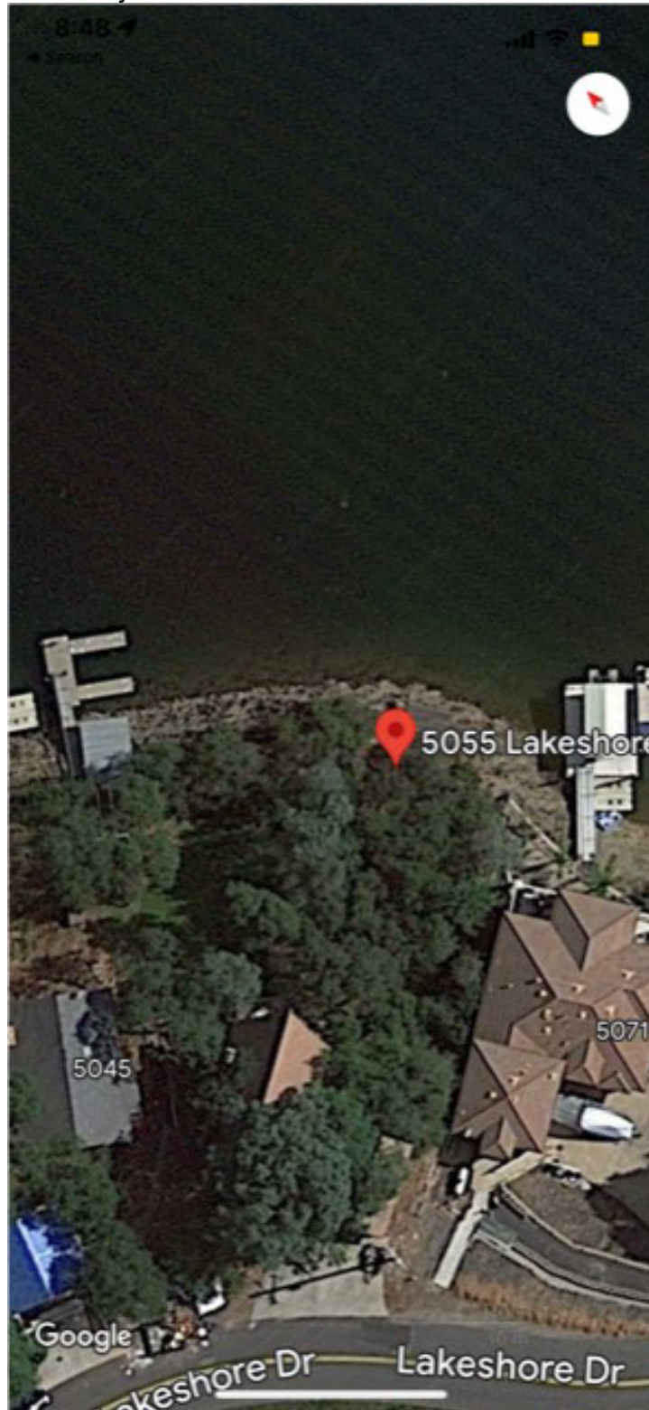
Figure 1: Aerial View of Project Location