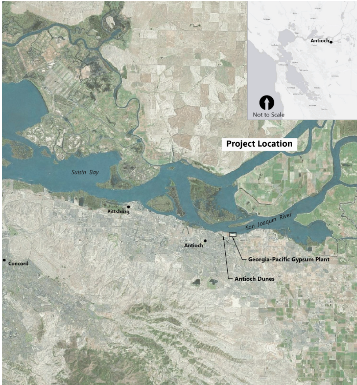
Figure 1: Site and Vicinity Map