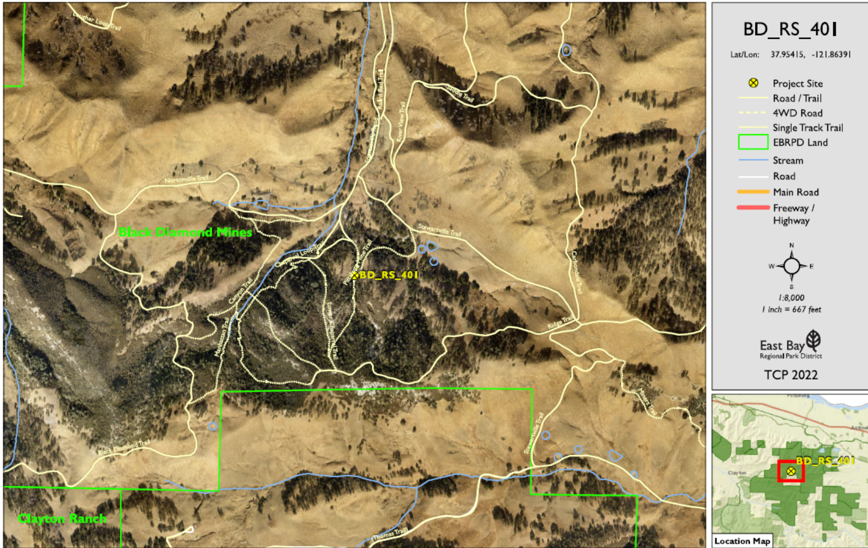
Figure 2: Project Location Map