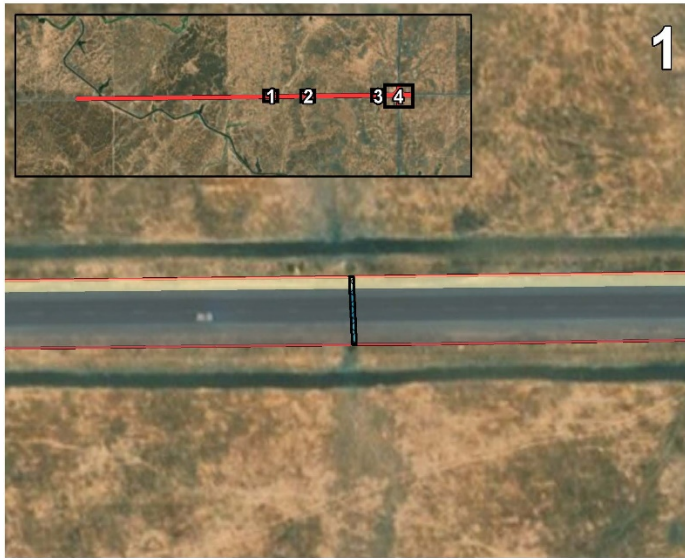
Figure 1- Temporary Impact Areas