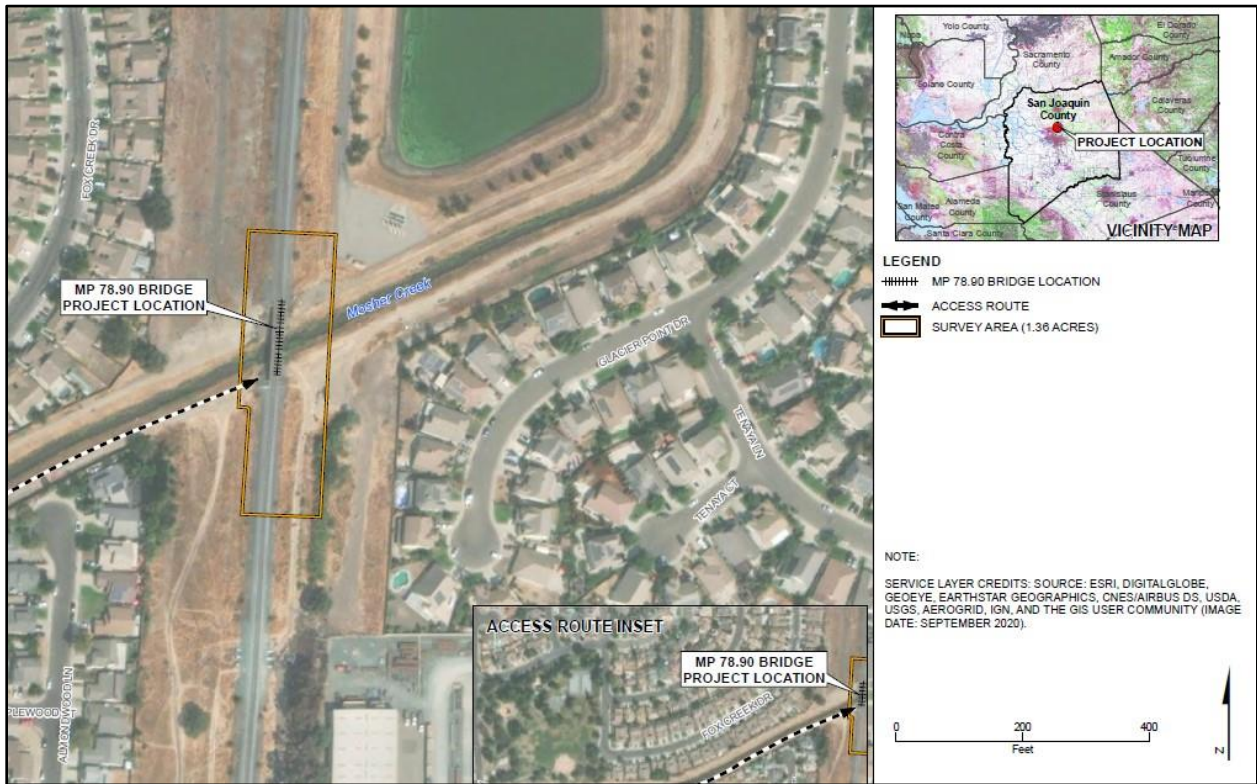
Figure 1 – Project Location Map