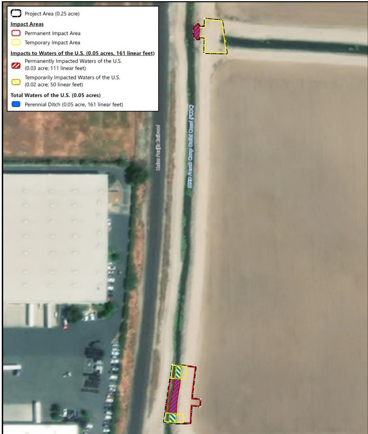
Figure 2: Project Impacts Map