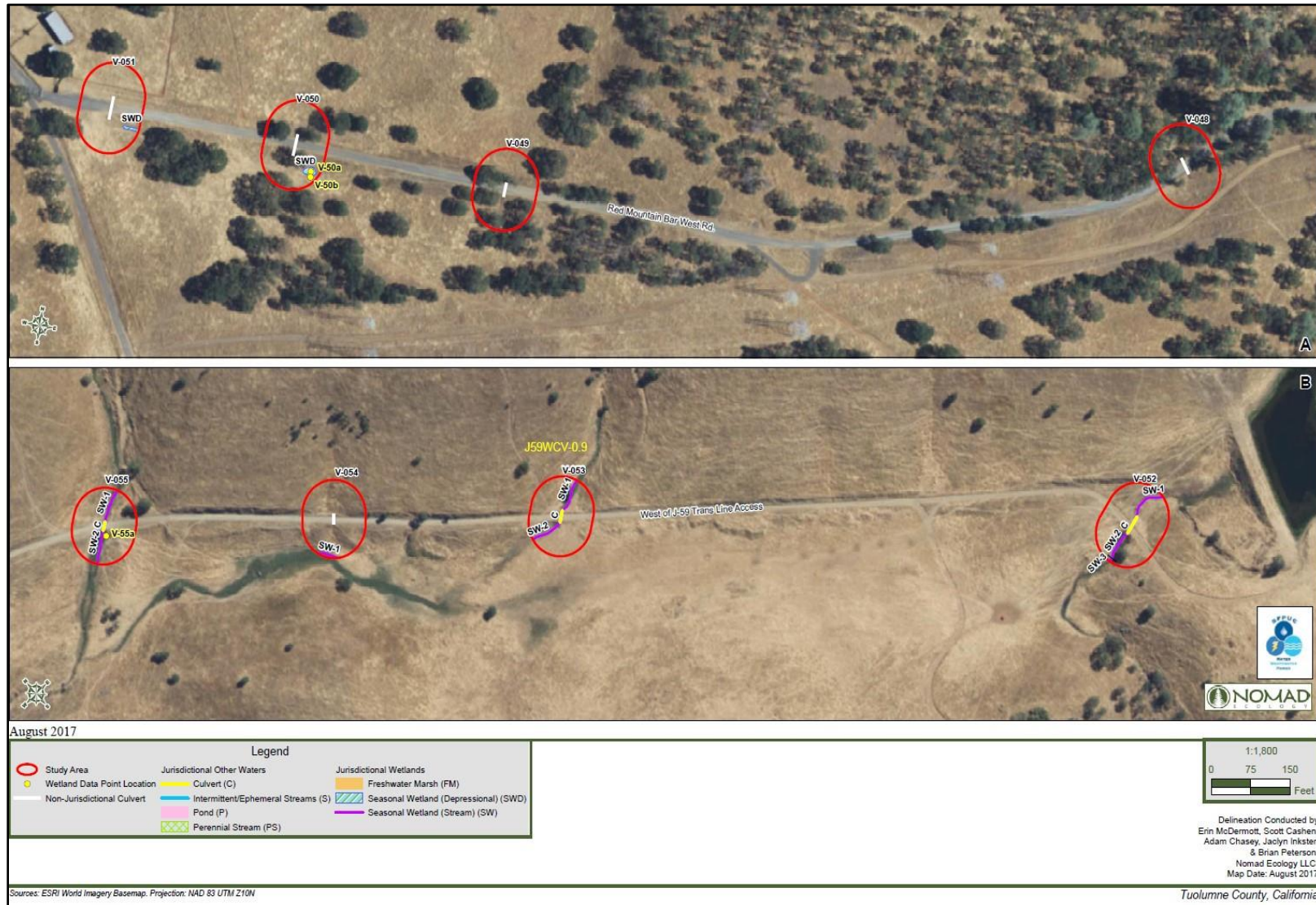
Figure 2 – Impacts to Aquatic Resources Map