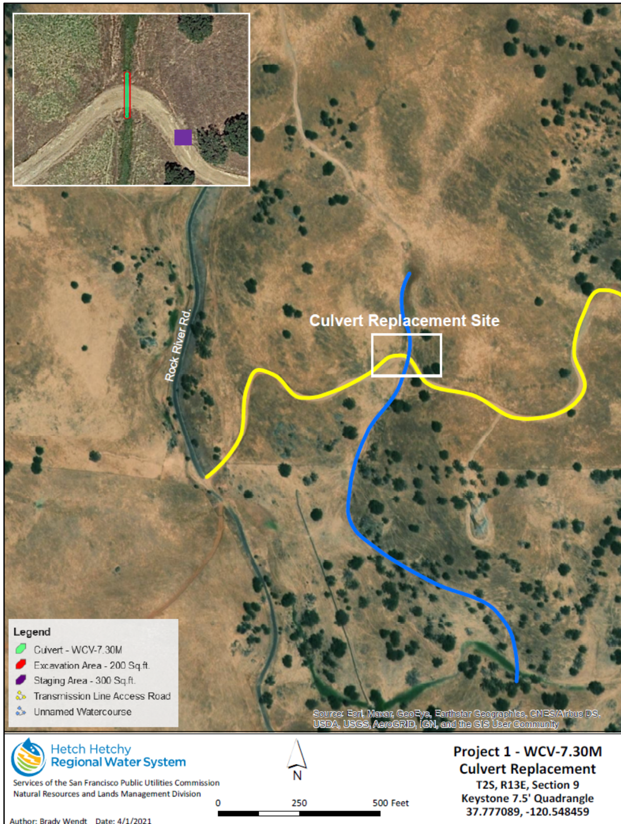
Figure 2 – Impacts to Aquatic Resources Map (WCV-7.30M)