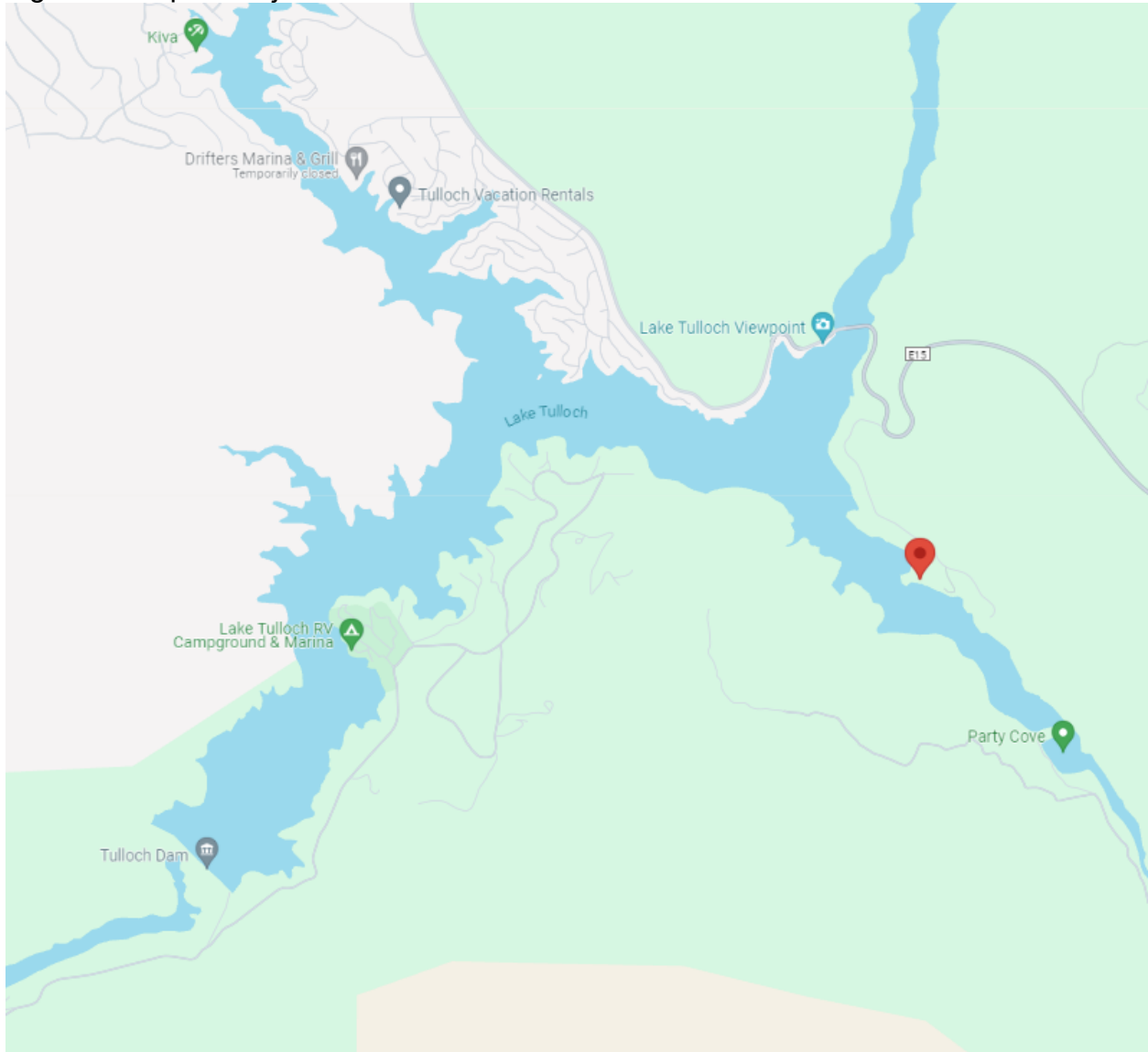
Figure 1: Map of Project Location