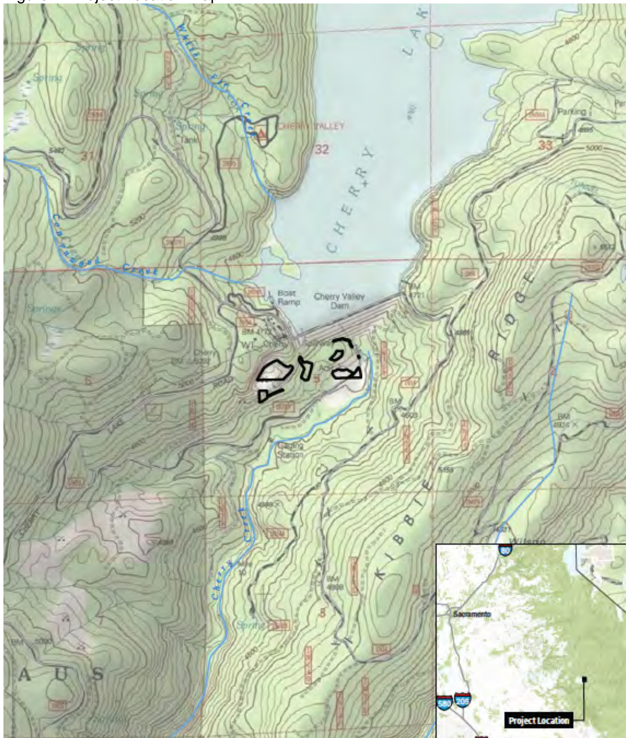
Figure 1: Project Location Map