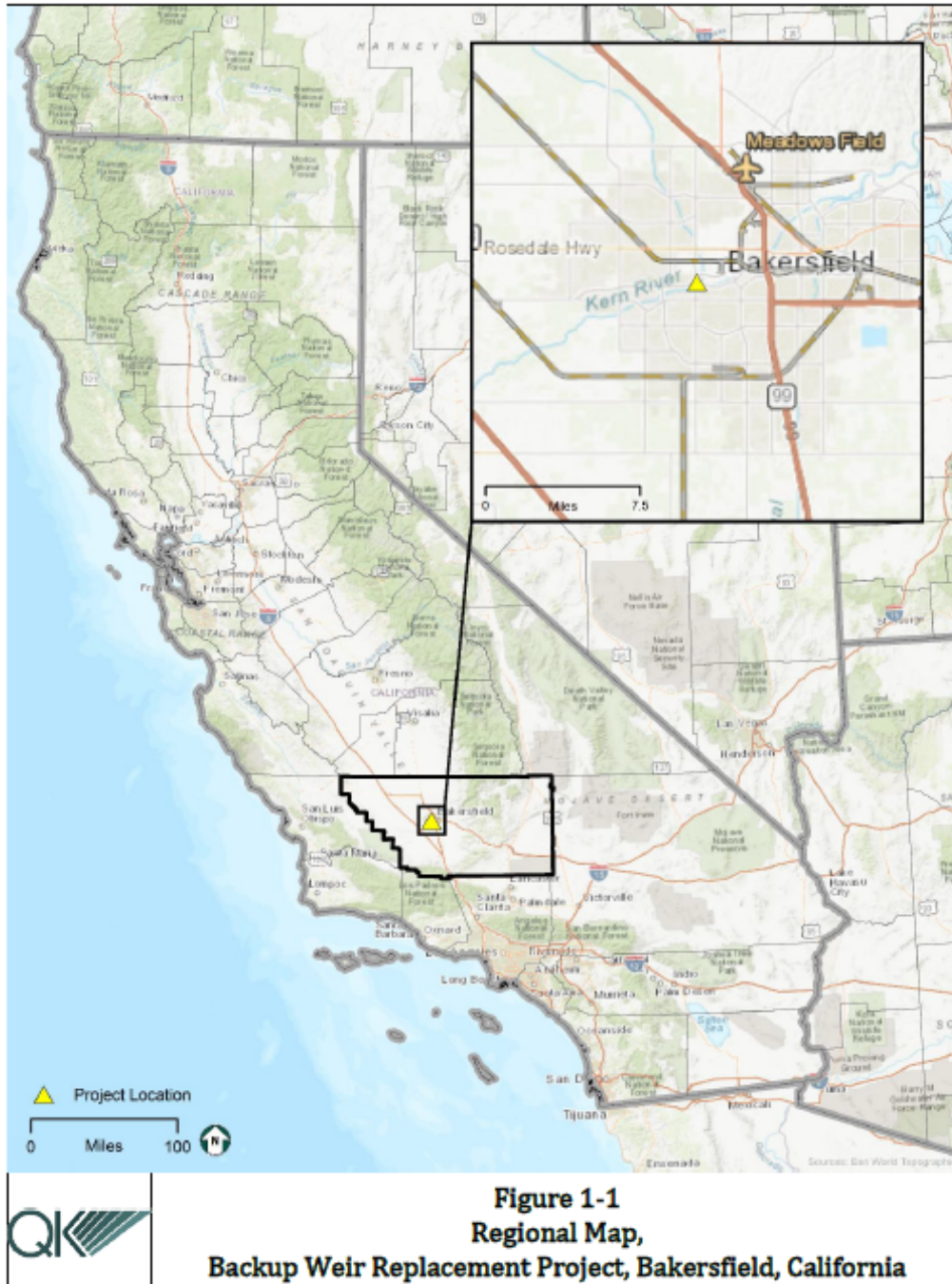
Figure 1: Project Vicinity Map