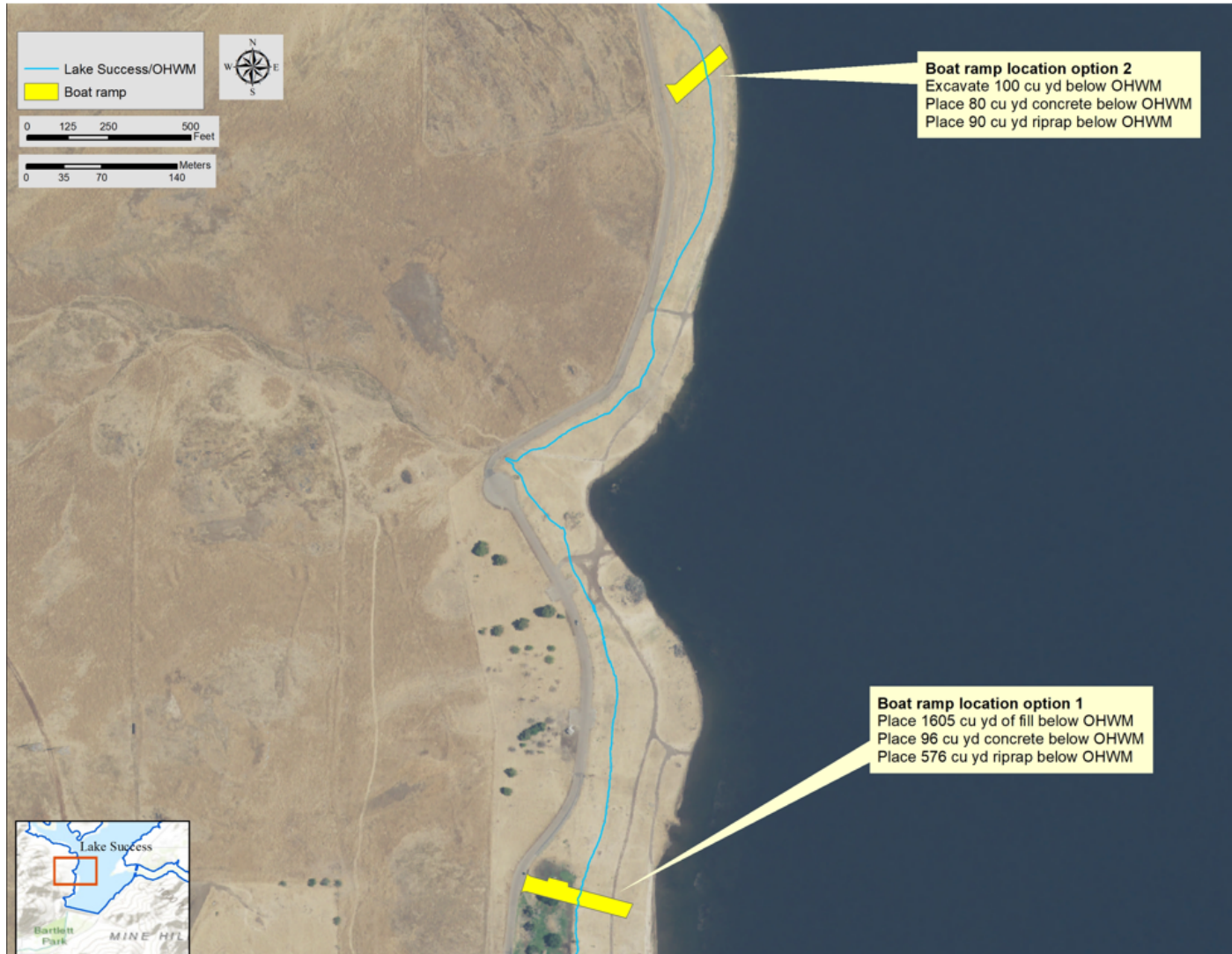
Figure 1. Map of Impacts to Aquatic Resources for Boat Ramps