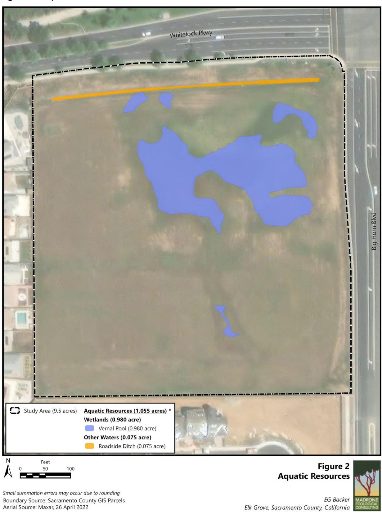
Figure 2: Aquatic Resources on Site