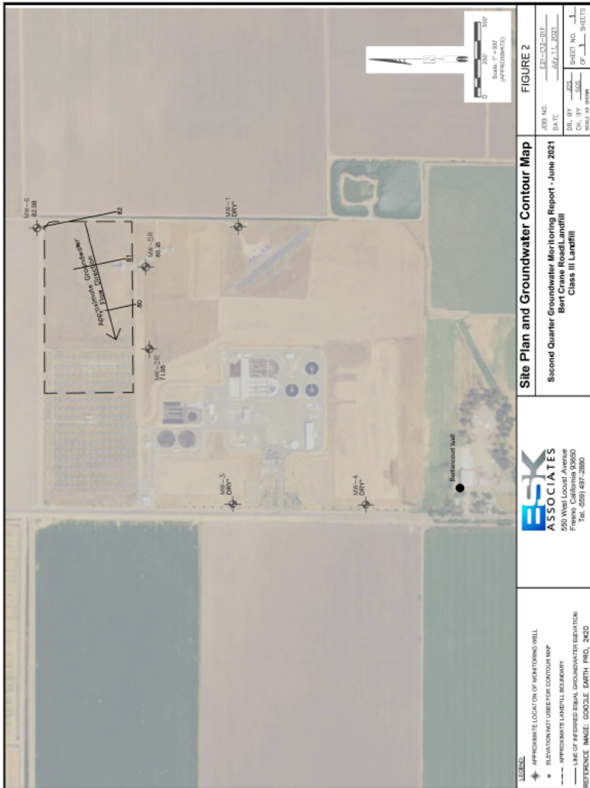
This Figure was taken from the Second Quarter 2021 Groundwater Monitoring Report.