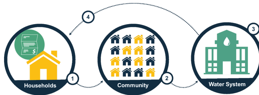
Figure G1: Nexus of Affordability and Water System Financial Capacity

In 2023, the State Water Board released a new web-based dashboard to help State Water Board staff and interested external stakeholders explore the relationship between a water system's financial capacity and drinking water affordability. The Water System Financial Capacity & Community Affordability Dashboard displays reported and calculated metrics/indicators that are used in the State Water Board's annual Drinking Water Needs Assessment. Figure G1 illustrates the nexus between affordability and water system financial capacity.