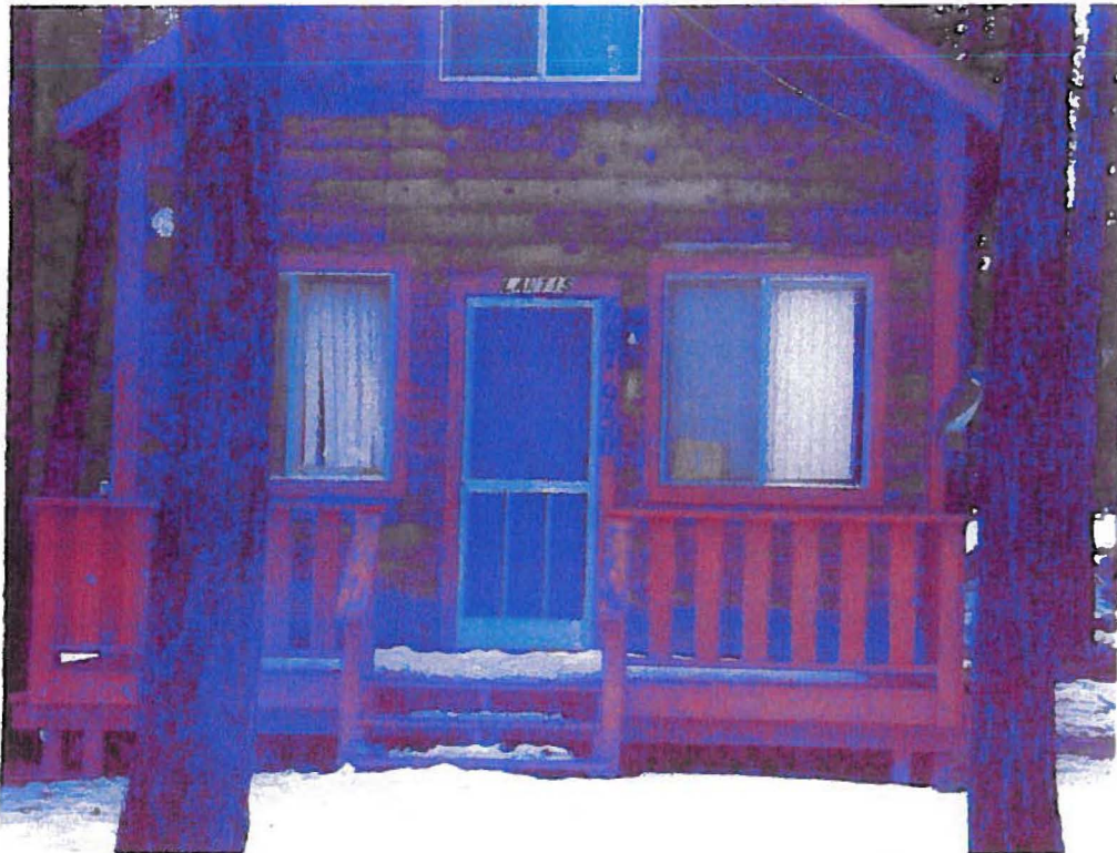
Photo No. 2: Spalding Tract 077-161-23-11, 687-950 Tulip Way, looking south from Tulip Way towards property.