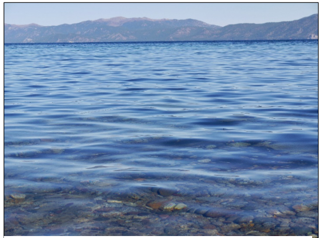
Figure 9.1 - Lake Tahoe's Nearshore

The Nearshore Agency Working Group (NAWG) comprised of Water Board, Tahoe Regional Planning Agency, Nevada Division of Environmental Protection, U.S. EPA, and Tahoe Resource Conservation District staff, have used the Nearshore Resource Allocation Program (NRAP) framework to prioritize information needs. In partnership with the NAWG, in 2018 the Water Board updated the Lake Tahoe Nearshore Water Quality Protection Plan. The update to this Plan identified five implementation strategies, which Water Board staff have been working to fulfill (see page 19 of the 2018 Updated Lake Tahoe Nearshore Water Quality Protection Plan for a more detailed summary).