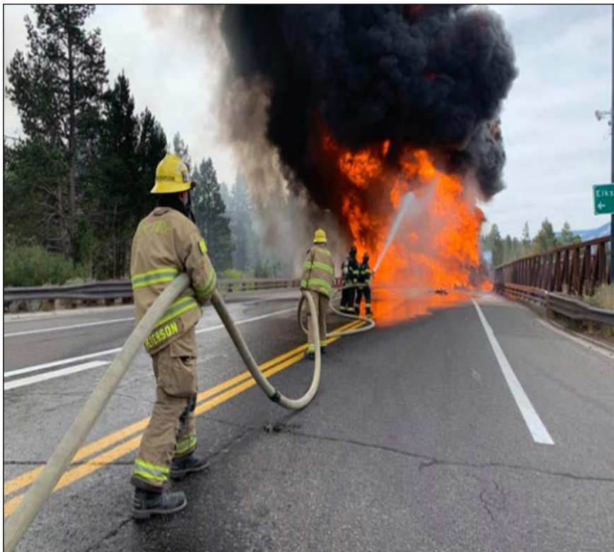
Figure 2.2 – Application of Aqueous Film Forming Foam (source: CDL Life News)