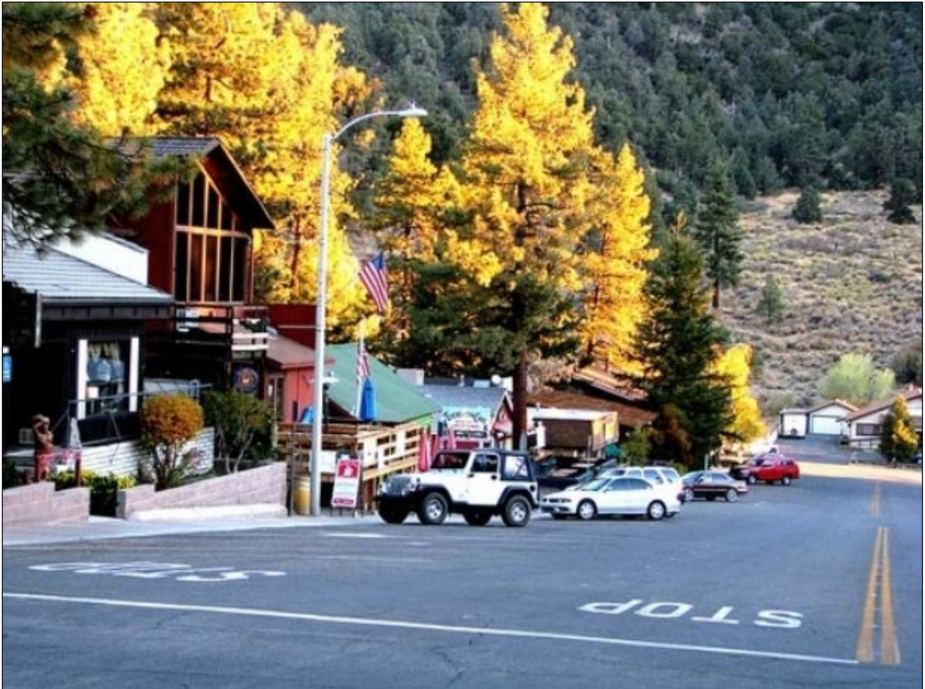
Figure 8.1 - Main Street Wrightwood looking north towards Swartout Creek.