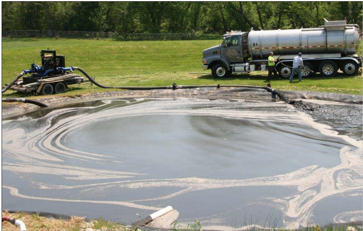
Figure 6.2 – Bio-solids in a lined surface impoundment.

Types of surface disposal sites for bio-solids include: