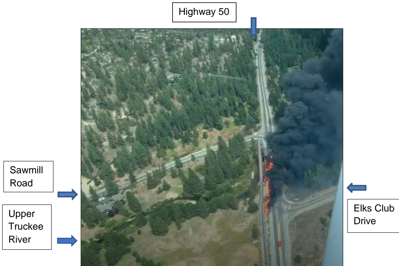
Figure 2.1 – Aerial View of Crash Site