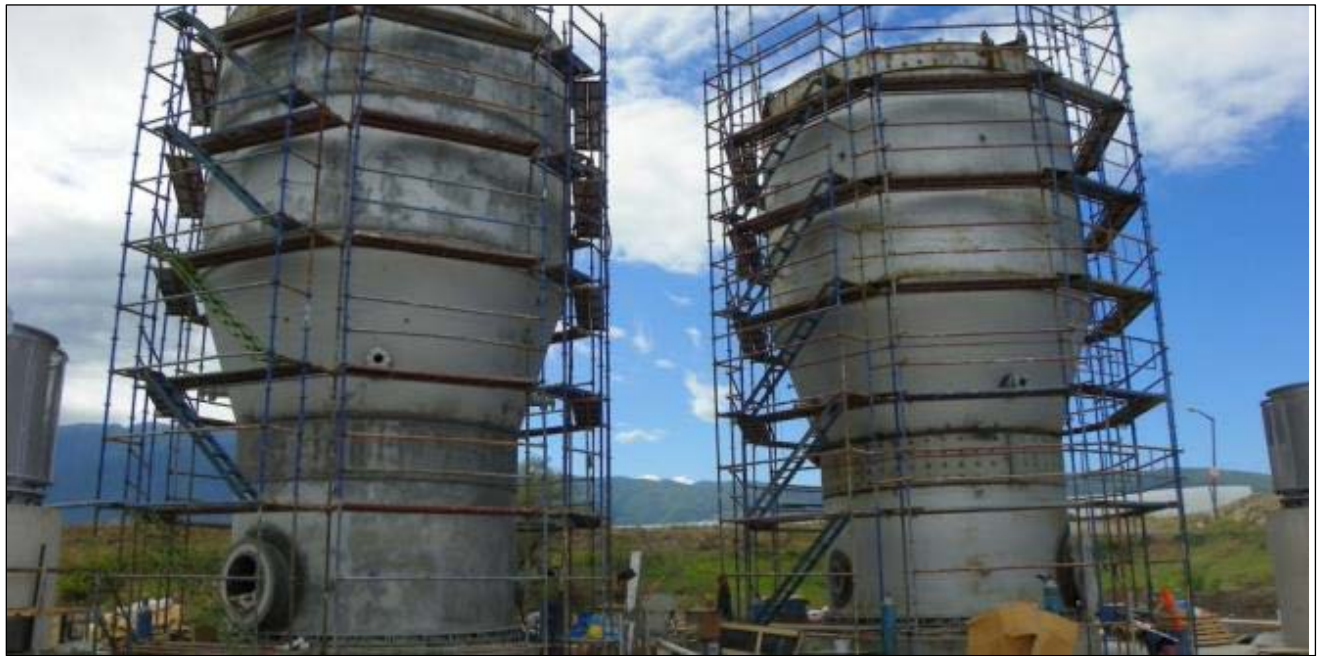
Figure 6.3 – Fluidized bed bio-solids incinerator used for most new installations to meet federal emissions standards

Fluidized bed incinerators are generally better at meeting air emission standards, so most new installations use this technology.