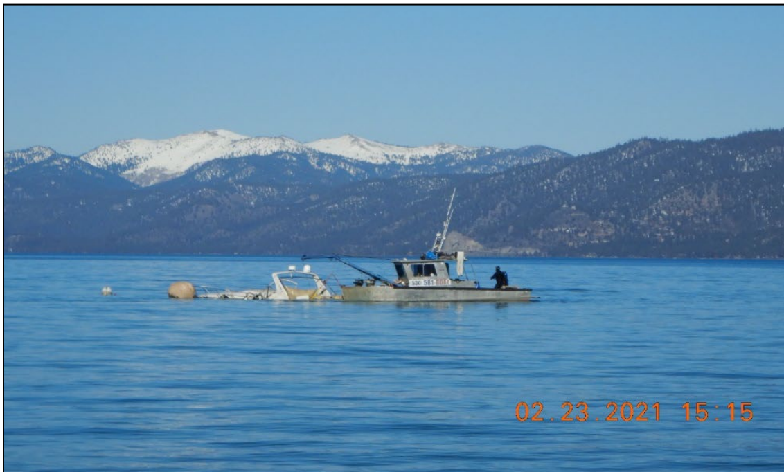
Photo No. 3.1 - High Sierra Marine preparing to tow the sunken boat from Jameson Beach to Tahoe Keys Marina

The Water Board, California Department of Fish and Wildlife, United States Environmental Protection Agency (US EPA), and El Dorado County Sheriff’s Department all have programs that can be implemented to address abandoned boats, with implementation being more complex for some programs than others. In this case, the Water Board’s and US EPA’s programs were enacted.