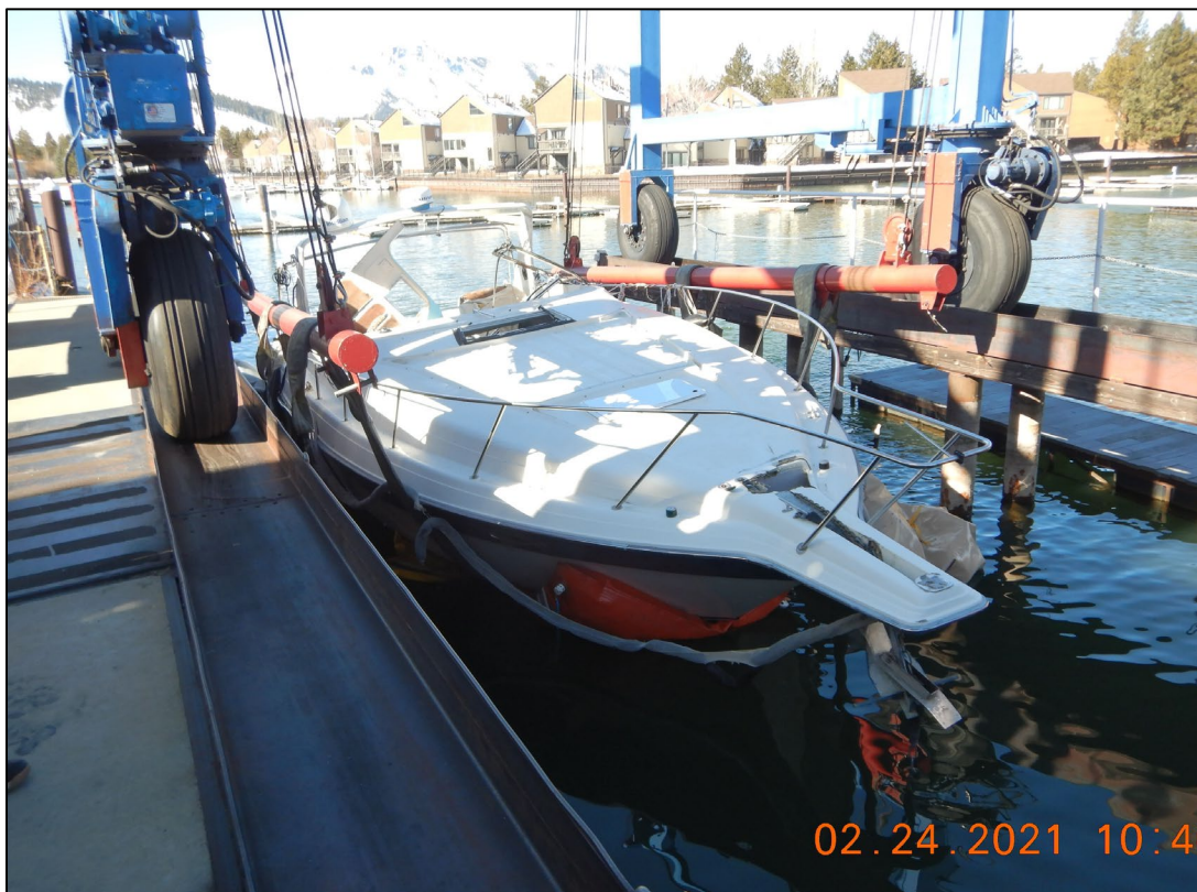
Photo No. 3.2 - Recovered boat being lifted out of the water at Tahoe Keys Marina

The responding agencies will be meeting to conduct an after-action review, and to share information regarding each agency's options and processes for responding to similar situations. The review will help the agencies improve response efforts in the future.