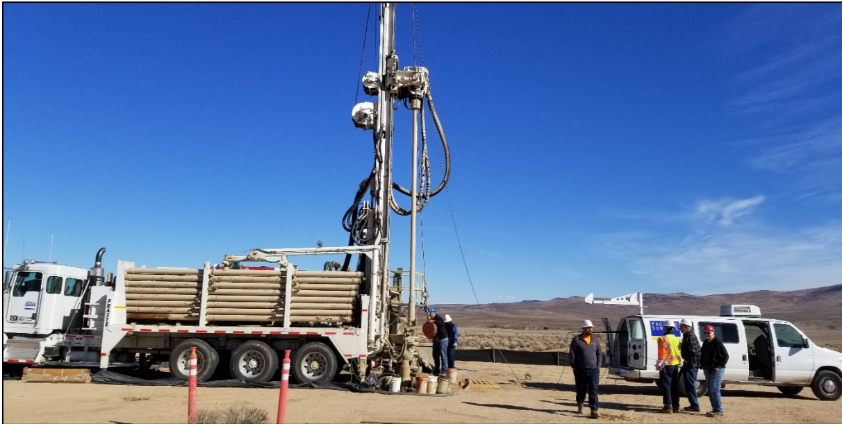
Figure 5.2 - Breaking down equipment after geophysical logging of the El Paso monitoring well borehole in the Indian Wells Valley Groundwater Basin. View looks east toward the El Paso Mountains.

The work is being completed for the IWVGA, the Groundwater Sustainability Agency (GSA) for the basin, through the Department of Water Resources (DWR) Technical Support Services (TSS) Program. The TSS Program offers support to GSAs by providing funding and services including monitoring well installation, geologic logging, borehole geophysical logging, borehole video logging, and groundwater level monitoring training. The TSS Program prioritizes requests from basins in critical overdraft.