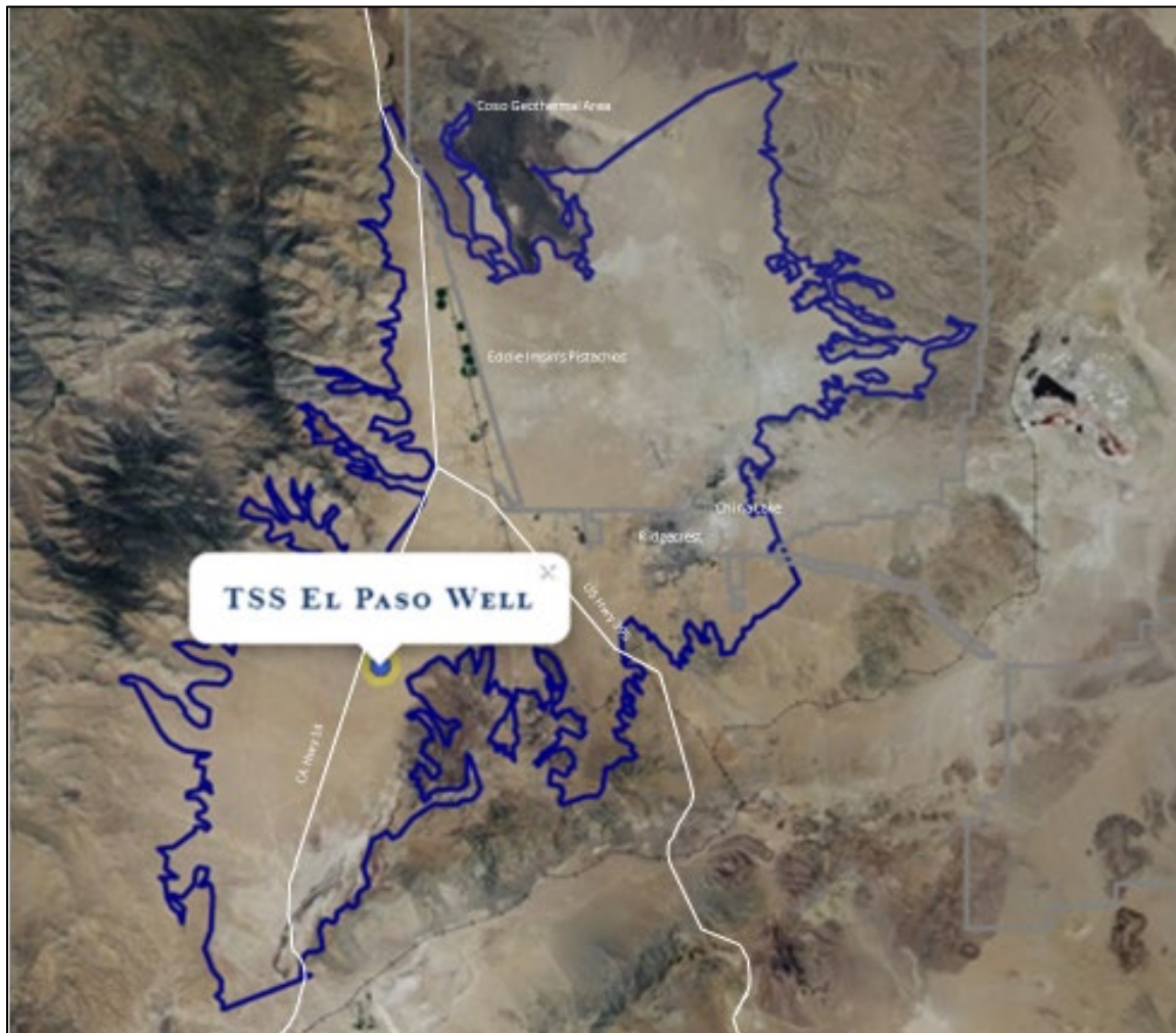
Figure 5.1 - Location of the Department of Water Resources (DWR) Technical Support Services (TSS) El Paso monitoring well drill site within the Indian Wells Valley groundwater basin (outlined in blue).

about 8 miles south of Inyokern and ½ mile east of California State Highway 14 (see Figure 5.1).