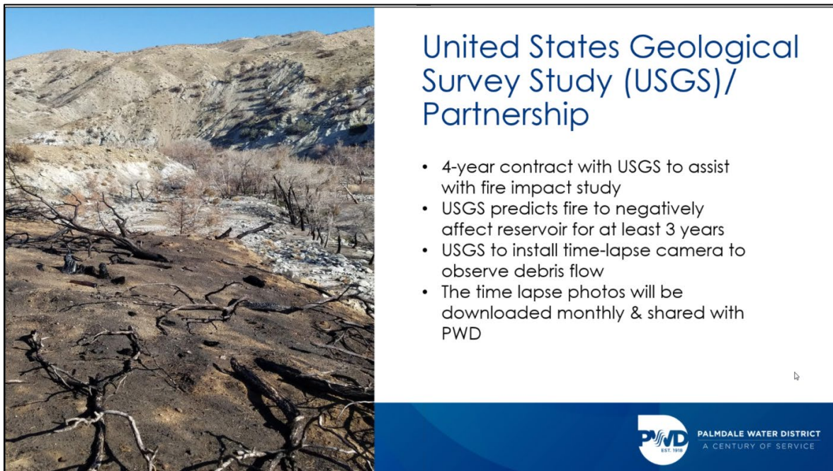
Figure 6.2 - Slide from Palmdale Water District presentation showing information on the upcoming USGS study.