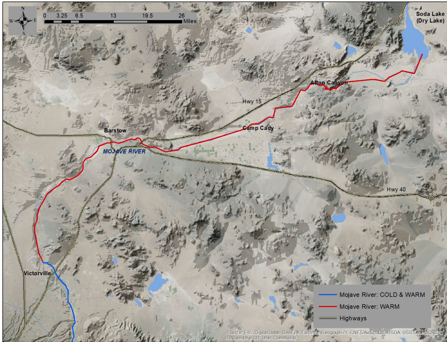
Figure 2-1.1 Map showing locations where the COLD and WARM freshwater habitat beneficial uses apply for the Mojave River