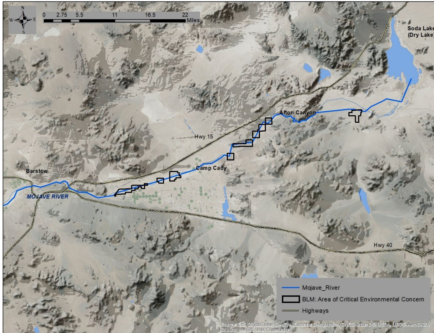
Figure 2-1.2 shows the Mojave Fringed-toed Lizard Area of Critical Environmental Concern (ACEC) as designated by the Bureau of Land Management. The reaches of the Mojave River that pass through these ACEC units are designated with the BIOL beneficial use.