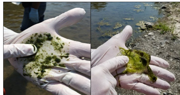
Photos show the difference between potentially non harmful algae (right) and harmful algae (left) while performing the gloved hand test.

(planktonic bloom). Other times, it is less visible, floating beneath the surface or on the bottom of a water body (benthic bloom). Blooms can appear green, blue, yellow, red, or brown. Several guidance documents are available to help identify algae and HABs ( Fact Sheet & Visual Guide ). Typically, harmful algae will not have a structure causing it to easily break apart or be hard to pick up where non-harmful algae will have a structure with long hair like filaments. There are several field tests you can perform to determine if the algae have a structure known as the stick test or the gloved hand test. You can find out how to perform these tests on the HAB wiki Field Test Webpage . You cannot tell if toxins are present in the HAB by visually looking at the bloom, so it is important to follow healthy water habits when you encounter a bloom.