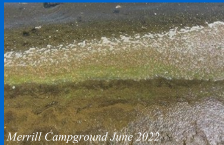
Merrill Campground June 2022

Eagle Lake was sampled for harmful algal blooms (HABs) prior to Memorial Day, Independence Day, Labor Day, and during a regular monitoring event at Merrill Campground and Christie Day Use area. Cyanobacteria toxins were found in the samples collected in June, July, and August at low levels. A caution advisory was put in place several times during the season due to the visual indication of a harmful algal bloom and due to the low levels of HAB toxins detected in water samples. If you suspect Eagle Lake is experiencing a HAB check the State Incident Report Map , and if no information is displayed on it for Eagle Lake report the bloom through the Bloom Report Form .