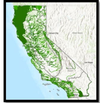
Click the above image to access the interactive Integrated Report Map.

Clean Water Act (CWA) Section 303(d) requires states to identify waterbodies that do not meet water quality standards. Waterbodies which do not meet water quality standards are placed on the CWA Section 303(d) List of Water Quality Limited Segments (also known as the list of impaired waterbodies, or the 303(d) list). Decisions to place waterbodies on the 303(d) list are governed by the Water Quality Control Policy for developing California's Clean Water Act Section 303(d) List. U.S. EPA must approve the 303(d) list before it is considered final.