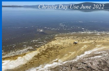
Christie Day Use June 2022