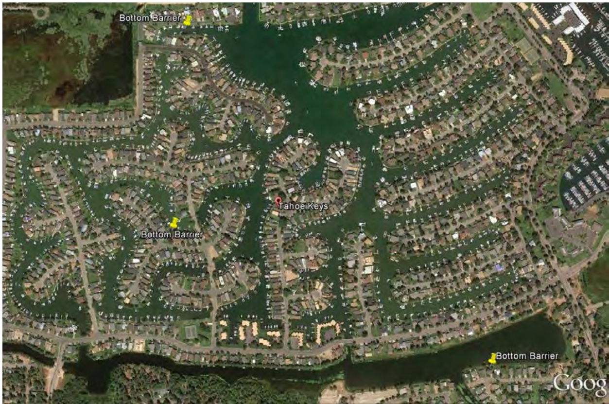
Figure 1. Location of 2017 Bottom Barriers

After all the bottom barriers were removed, the treated areas were inspected by the homeowner for plant growth. The barriers were effective in preventing the growth of aquatic weeds directly underneath them but it was noted that plants were growing near the edges of the barriers and on top of the barriers in the sediment that had accumulated there. It was also noted that, while the bottom barriers were effective, they only covered between 100 and 400 square feet (depending on the amount and size that each property received) and the rest of the cove was densely infested with aquatic plants.