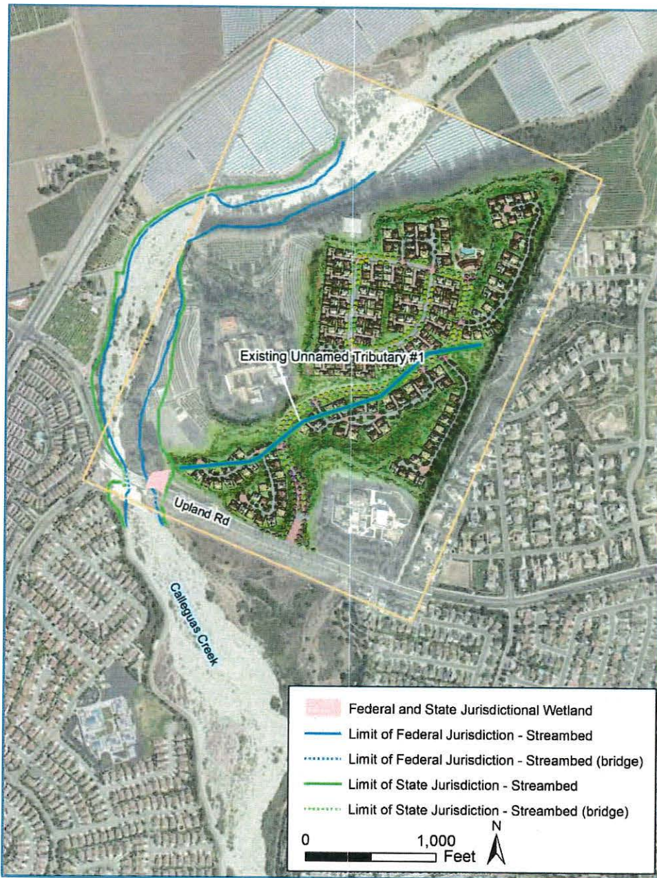
Exhibit B. Conceptual Development Plan Overlay on Jurisdictional Map