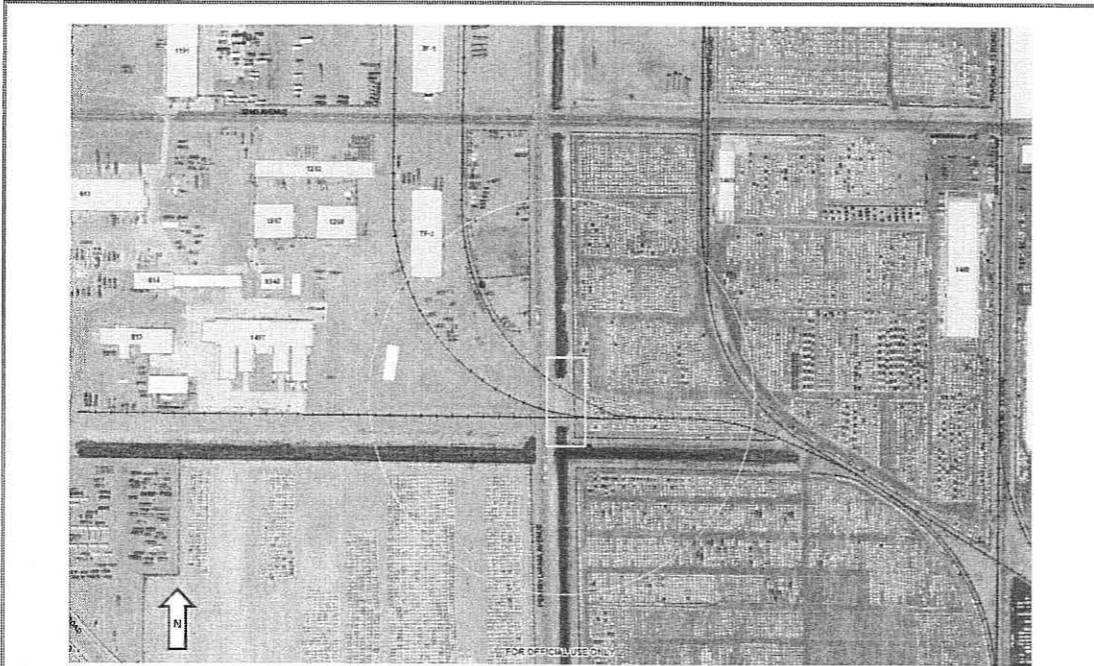
Aerial Map (north at top) Showing Project Area (yellow box) and General Project Buffer/Area of Potential Effect (100 meters).