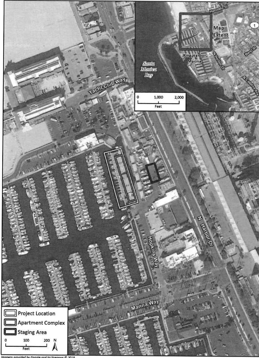
Figure 1 Apartment at King Harbor in King Harbor Marina, Redondo Beach, California

MCL Marina Corporation King Harbor Marina Apartment Complex Structural Support Improvements Project