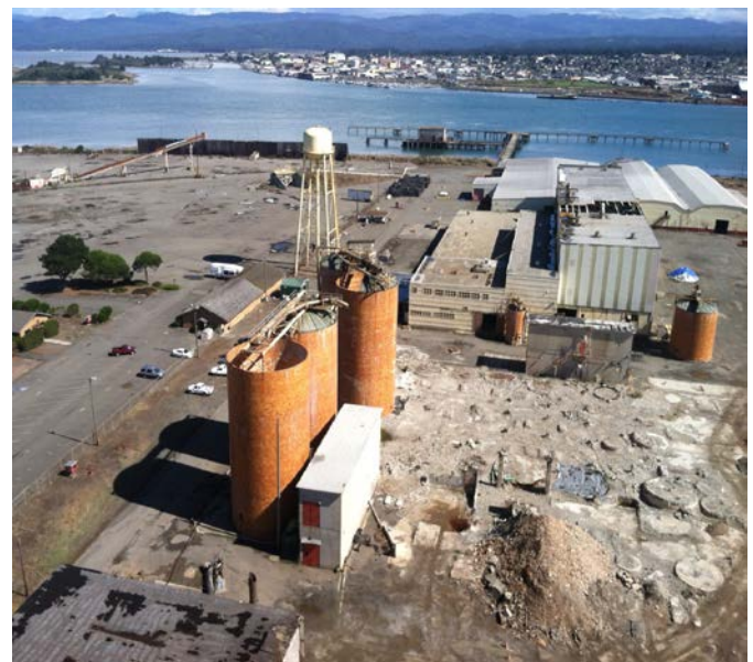
Photograph by Regional Water Board Staff Rebecca Fitzgerald in September 2013.

In February 2009, Freshwater Tissue Company (FTC) purchased the site with the hope of