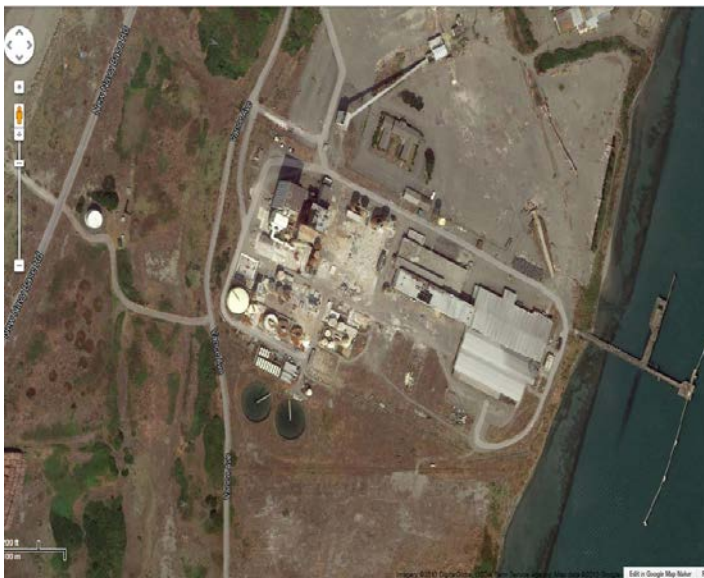
Aerial Image of the former mill with Humboldt Bay on the right side of the image.

converting forest residuals into toilet paper. Funding could not be secured to support the proposed site reuse. Subsequently, demolition activities and the recovery and recycling of various metals began at the site during FTC's ownership.